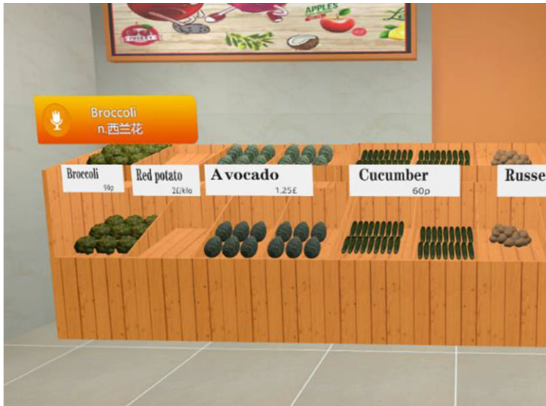
Figure 4. Vocabulary shown in orange with the sound of the pronunciation.