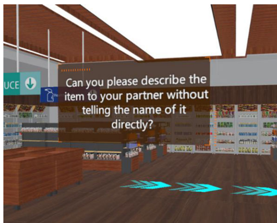
Figure 5. A sentence example for activity instruction and indication signs.

group. Students in the classroom groups (SC and TC) were permitted to try the HiVR intervention after all data collection was completed.