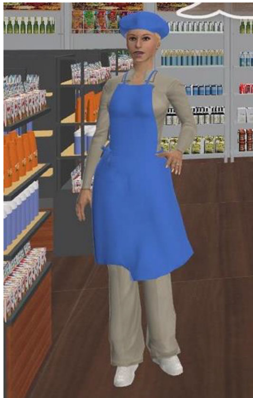
Figure 3. The avatar of a supermarket assistant.

sound of applause, would show up automatically when students completed each learning activity. There was no time limit for each session.