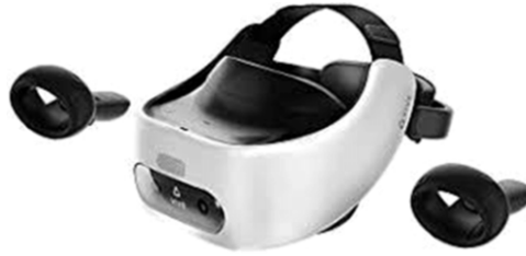
Figure 2. HTC Vive Focus Plus display and controllers.