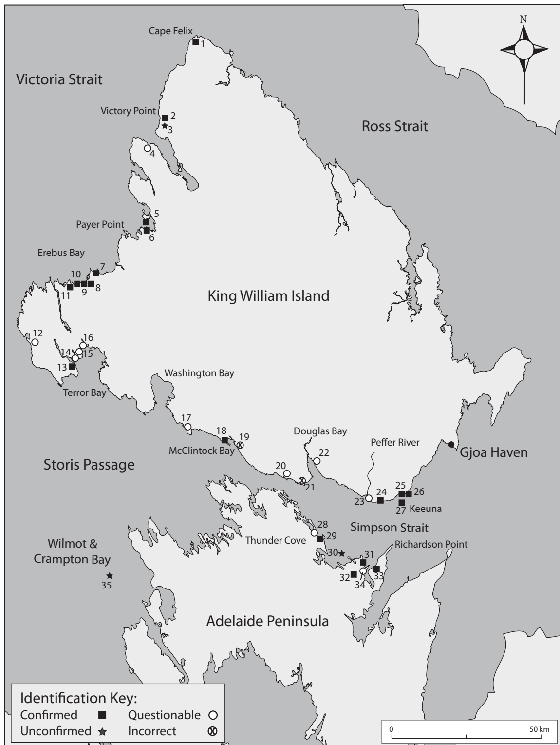
Fig. 1. Locations on King William Island and Adelaide Peninsula where human remains attributed to the Franklin expedition have been reported or found.