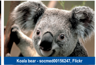
Koala bear