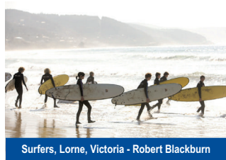
Surfers, Lorne, Victoria