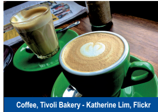
Coffee, Tivoli Bakery