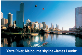
Yarra River, Melbourne skyline