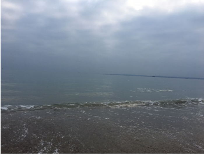
Figure 1. Beach in winter? Why not? From Zarabadi (2021).

Maha's multispecies stories and experiences of becoming-with sea, water and shark emerge in precarious times when Muslim lived experiences affectively, materially and discursively intertwine with terrorism, radicalisation, threat and fear proliferated in the public through Prevent policy 2 in and beyond school and media coverage of Muslim-related topics. Maha's watery assemblage starts from a photo (Figure 1) in her photo-diary. The photo of a grey wintry beach with the thick cloudy sky, the horizon of entangled grey sea and sky, the dark emptiness and no-thing-ness in the photo.