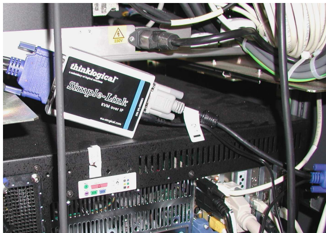
Figure 1. SimpleLink device installed on host PC