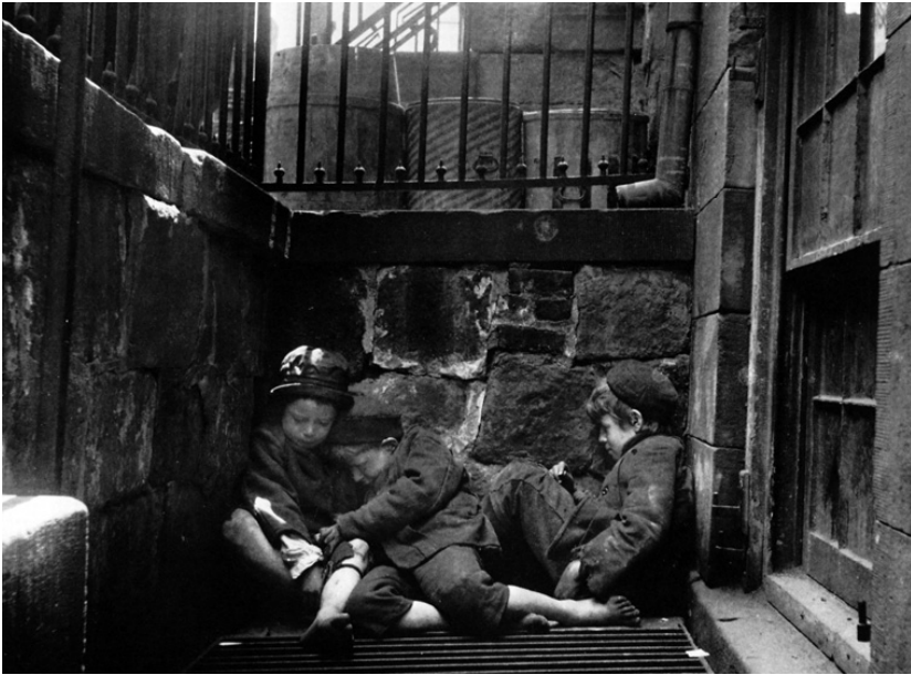
Figure 9.1 Jacob Riis, Children sleeping in Mulberry Street , New York City, 1890. Public Domain.

What disturbed the gentry was not just the indigence. It was the sensation that worlds were merging in their city but classes were diverging; it was that the differences and disparities were brought close, nearby: those hungry, needy kids from Italy or Galicia were underfoot. This was an affront to the prevailing Gilded Age narrative of welcoming at the height of nineteenth-century integration. Closing distance cast light – literally and figuratively – on widening differences that became the obsession of social reformers. The result was a recognition that, for all that steam and cables wired the world into one survival unit, it was a world of strangers. Moreover, it was seen – and hence the importance of lens-based media – as a world divided between the familiar and the strange, the civilised and the barbarian, the haves and the have-nots, sharing one, divided, planet.