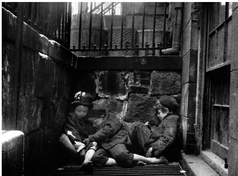
Figure 9.1 Jacob Riis, Children sleeping in Mulberry Street , New York City, 1890. Public Domain.

What disturbed the gentry was not just the indigence. It was the sensation that worlds were merging in their city but classes were diverging; it was that the differences and disparities were brought close, nearby: those hungry, needy kids from Italy or Galicia were underfoot. This was an affront to the prevailing Gilded Age narrative of welcoming at the height of nineteenth-century integration. Closing distance cast light – literally and figuratively – on widening differences that became the obsession of social reformers. The result was a recognition that, for all that steam and cables wired the world into one survival unit, it was a world of strangers. Moreover, it was seen – and hence the importance of lens-based media – as a world divided between the familiar and the strange, the civilized and the barbarian, the haves and the have-nots, sharing one, divided, planet.