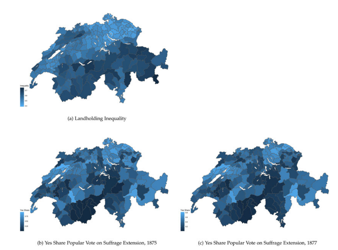
Figure 2. Landholding inequality and support for suffrage extension at the district level.

two lower maps show. However, Fig. 2 clearly shows that the major opposition against suffrage extension in 1875 and 1877 came from the southern Alpine regions (see also Fig. A2 in the appendix), which runs counter to claims that the Alpine regions were the most equal areas and supportive of democratization (Boix 2003, 112–8).