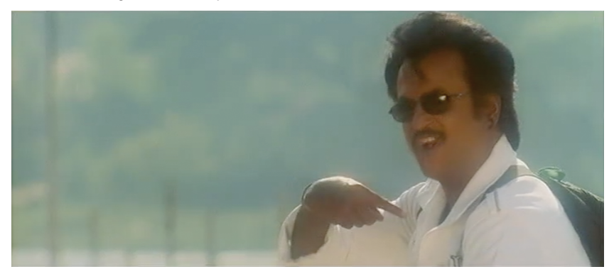
Figure 11. "My name is Padaiyappa!," from the eponymous introductory song "En peru Padaiyappa," Padaiyappa (1999).

tity, or simply as a stylish mannerism. What I suggest in what follows, however, is that these ostentatious fingers cannot be thought of independently of Rajini's acts of ostension (and vice versa), for it is through his ostending index finger that Rajini's presence can encompass the scene of his appearing. This encompassment, I argue, enables Rajini's cine-political potential.