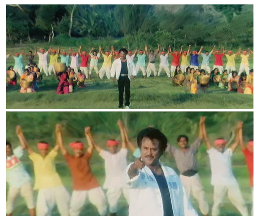
Figure 13. Rajini walking toward the camera (top) while pointing at (bottom) and singing to us in the song "En peru Padaiyappa" (My name is Padaiyappa!), from Padaiyappa (1999): "Is it not right for me to sacrifice my body and soul to the cause of the Tamil language and people?" (En uțal poruļ āviyai Tamilukkum Tamilarkkum koțuppatu murai allavā?).

us, and now even one of us—here we find a complex transposition and series of transactions across the screen's multiple sides. The aura of Rajinikanth, presenced through the screen by his fingers, acts to incorporate this indexed object—his audience—into his complexly mediated being, entailing a consubstantiation between sign and object that makes this object into his image (fig. 14; cf. CP 2.748).