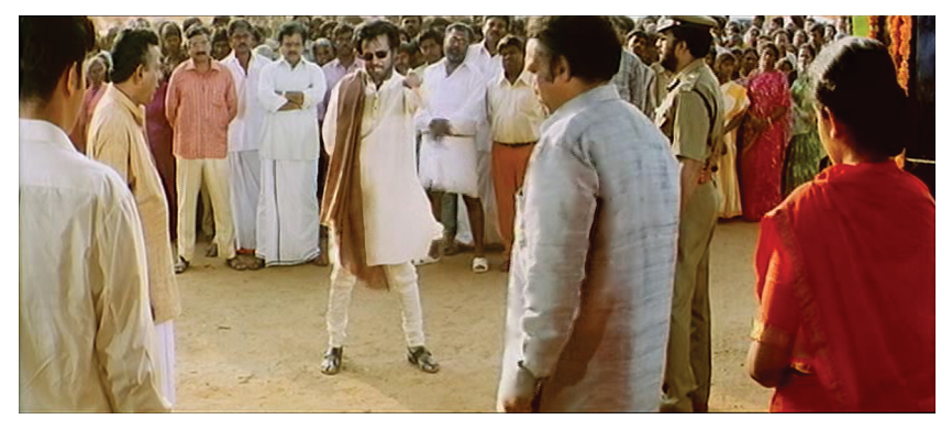
Figure 17. Rajini/Padaiyappa points at Neelambari and others with his left index finger while saying, in Tamil, "You have political influence"; from Padaiyappa (1999).

and gravity of his gesture accompanied by a swoosh sound effect; see fig. 19, bottom), has the people's influence ("enakku makkal selvākku" [I have the people's influence]).