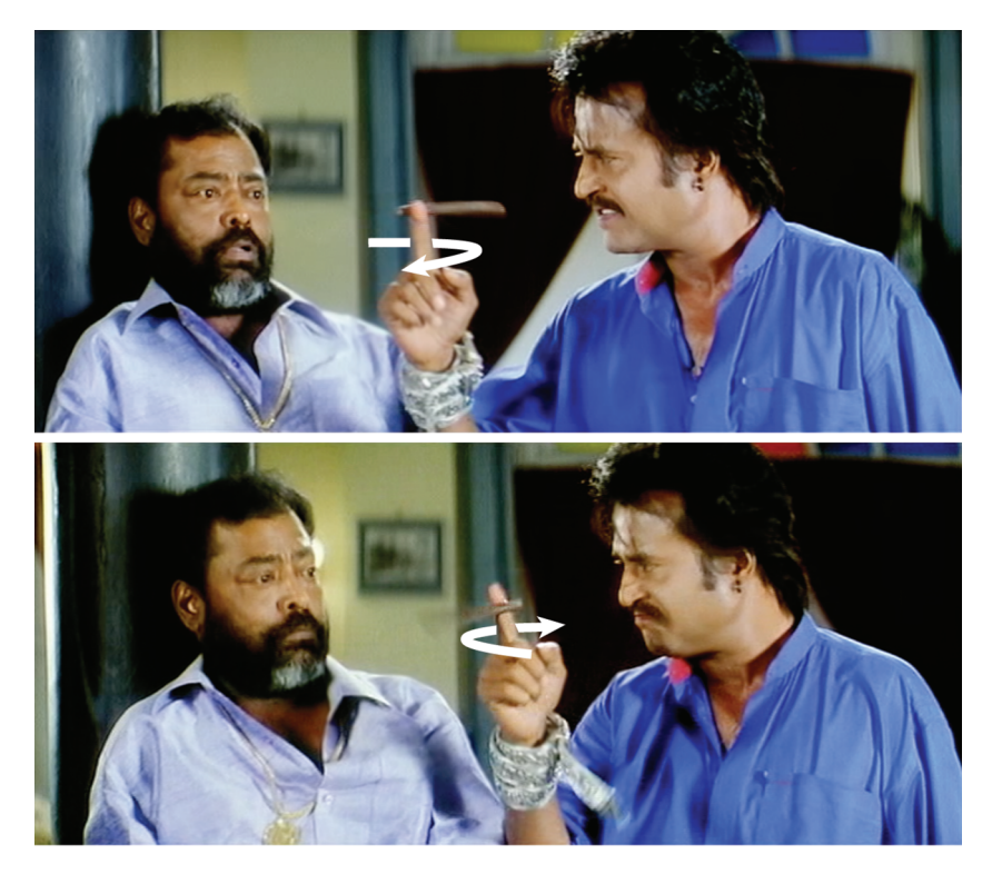
Figure 7. Rajini/Padaiyappa rapidly spins a cigar on his index finger for 2.8 seconds of reel time, intimidating his uncle and shocking and impressing his cousins in Padaiyappa (1999). Arrows are added by the author.

Rajini/Padaiyappa proceeds to flick the cigar into his mouth from a distance (Rajini's most repeated and emblematic act of style ), the shot repeated twice, first in a medium close-up and then in a medium shot. After another cutaway