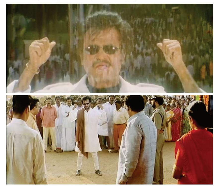
Figure 19. Top: "One hundred armies that stand behind Padaiyappa"; bottom: "I have the people's influence." The top image is from the opening song of Padaiyappa (1999), poetically prefigured as the "trailer" to the preclimax ("Did you see Padaiyappa's army?") in the bottom image.

(recall the Tamil lyric from the song "En peru Padaiyappa" [fig. 13]: "Is it not right for me to sacrifice my body and soul to the cause of the Tamil language and people?"), that is, to the audience before him and at whom he gazes, who both in this song and in the preclimax scene—are invited to join Rajini and become part of his spectral, yet substantial, being.