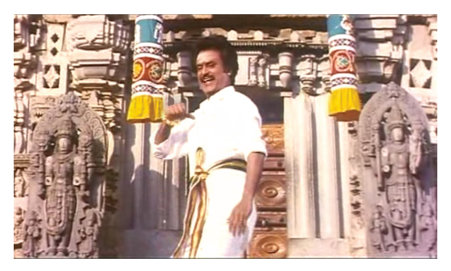
Figure 10. "I'm Arunachalam, man!," from the opening Tamil lyric of the introductory song "Athanda ethanda," Arunachalam (1997; director: Sundar C.).

As we have seen, Rajinikanth's finger is used in a number of different ways, many of which are not deictic pointing gestures: as a dance move, as a gesture of emphasis or threat, as a salute, as an icon of some linguistically denoted en-