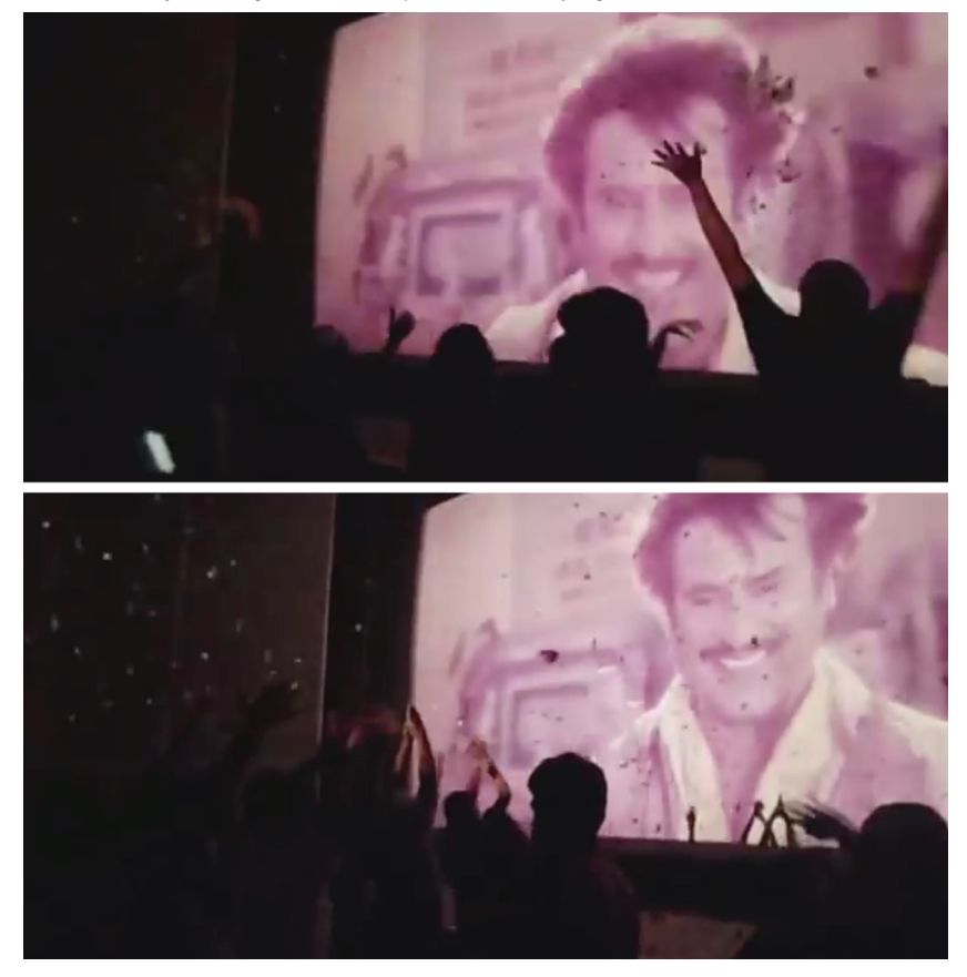
Figure 5. Screenshots of fans throwing confetti, clapping, and yelling praise at Rajini's introduction sequence in a re-screening of Baashaa ; source: https://youtu.be/ RKJKHxsiqn0, uploaded by Vijay Andrews, November 6, 2011.

mentier 2014, S5). It may also include direct address to the audience or even reference to the time and place of theatrical viewing,<sup>24</sup> as with the image that Rajini's fans are addressing in figure 5 which, as we saw above, finishes with a traditional gesture of greeting ( vaṇakkam ) to the camera/audience (fig. 4).