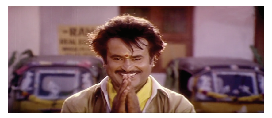
Figure 4. Rajinikanth's revelation: greeting the audience in Baashaa (1995) after making his grand entry.

This image responds. As figures 4 and 5 show, this proleptic response takes the form of an aesthetics of frontality that continually shows us the eyes and face of the hero-star as he looks straight at us (Kapur 1987; cf. Leone and Par-