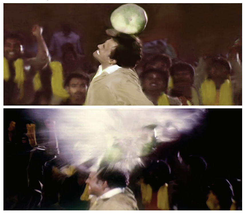
Figure 3. Enter Rajini: Rajini/Manikkam smashing the tiruṣți pumpkin in Baashaa (1995; directed by Suresh Krissna).

This image responds. As figures 4 and 5 show, this proleptic response takes the form of an aesthetics of frontality that continually shows us the eyes and face of the hero-star as he looks straight at us (Kapur 1987; cf. Leone and Par-