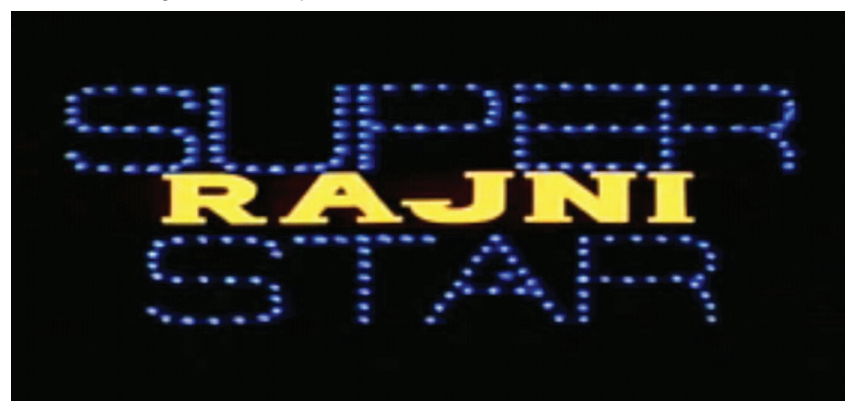
Figure 2. Rajinikanth's 1990s-era title-credit sequence: "SUPER STAR" is written, dot by dot, onscreen followed by the letters R - A - J - N - I [ sic ] that fly toward the audience, one at a time, accompanied by a laser sound-effected swoosh, and then return altogether to sit between "SUPER" and "STAR." A bright white outline lights up the edges of the word "RAJNI," and then subsides. "RAJNI" then flies off the screen into the background as "real" (Rajini), his name in Tamil script, flies in to replace it. It too is then emblazoned by a white outline.