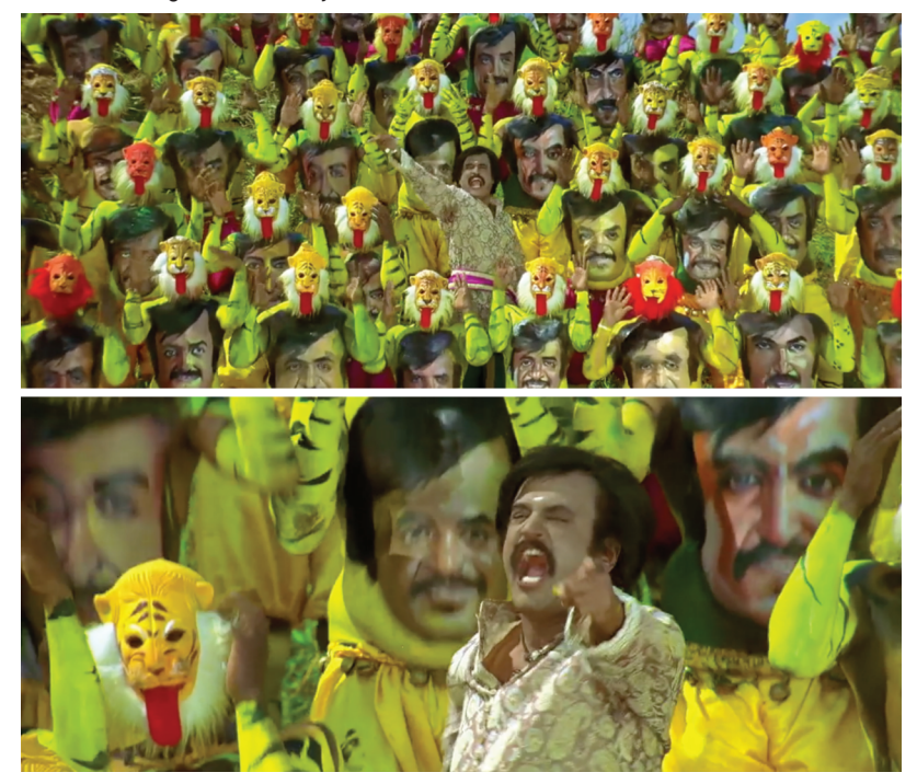
Figure 14. Made into his image: the images in this figure are from the colorful and spectacularly picturized song "Balle Lakka," the opening song of Sivaji: The Boss (2007), the chorus of which articulates an updated neoliberal vision of Rajini as developmental savior and leader of Tamil Nadu (the lyrics accompanying these shots translate as "Hey Bale Lakka Bale Lakka; To Salem, Madurai, Madras, Trichy, or Thiruthani; Hey Bale Lakka Bale Lakka; For all the people, if our elder brother [Rajini] comes, the whole of Tamil Nadu will become America!"). The bodies that stand behind, beside, and in front of Rajini have tiger heads and makeup (a cinematic retooling of the folk dance puliyāṭṭam , or "tiger dance," the tiger being a symbol of ferocity and power), their naked torsos each adorned with a unique rendering of Rajini's face (instead of a tiger's, as in puliyāṭṭam ). During this sequence, the feline bodies jump up and down, causing the plump paunches of the male dancers, these Rajini simulacra—whose hearts and guts have been painted over with Rajini's smiling face—to nod along with Rajini, their model, as he frenetically points in every direction, including at the camera/audience (right).

and encompassment that I have been describing is reflexively narrativized by the film, functioning as an allegory for the very cine-politics that it performatively enacts.