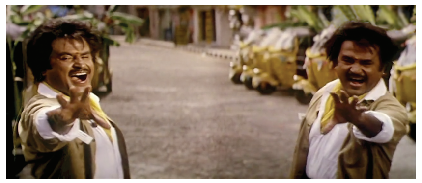
Figure 6. "Ha!" Rajini at the end of the introductory song "Naan autokaaran" (I'm an auto-driver) from Baashaa (1995), multiplied onscreen and reaching out to touch you.

not just broken but crossed by Rajini's outstretched fingers, the introductory song of Baashaa concludes, and the story begins.