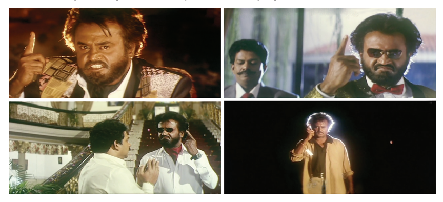
Figure 9. Iterations of a punch dialogue: "If I say it once, it's like I said it a hundred times" from Baashaa (1995). Of this punch dialogue (authored by Rajini himself), the director of the film, Suresh Krissna notes that, "Rajini doesn't use the power-packed line too many times in the film [NB: only four times], but every time he does, force—both physical and mental—emanates from it" (Krissna and Rangarajan 2012, 147).

onscreen revelation, entails a particular kind of "existential relation" for Rajini's acts of pointing: a relation of encompassment and incorporation.