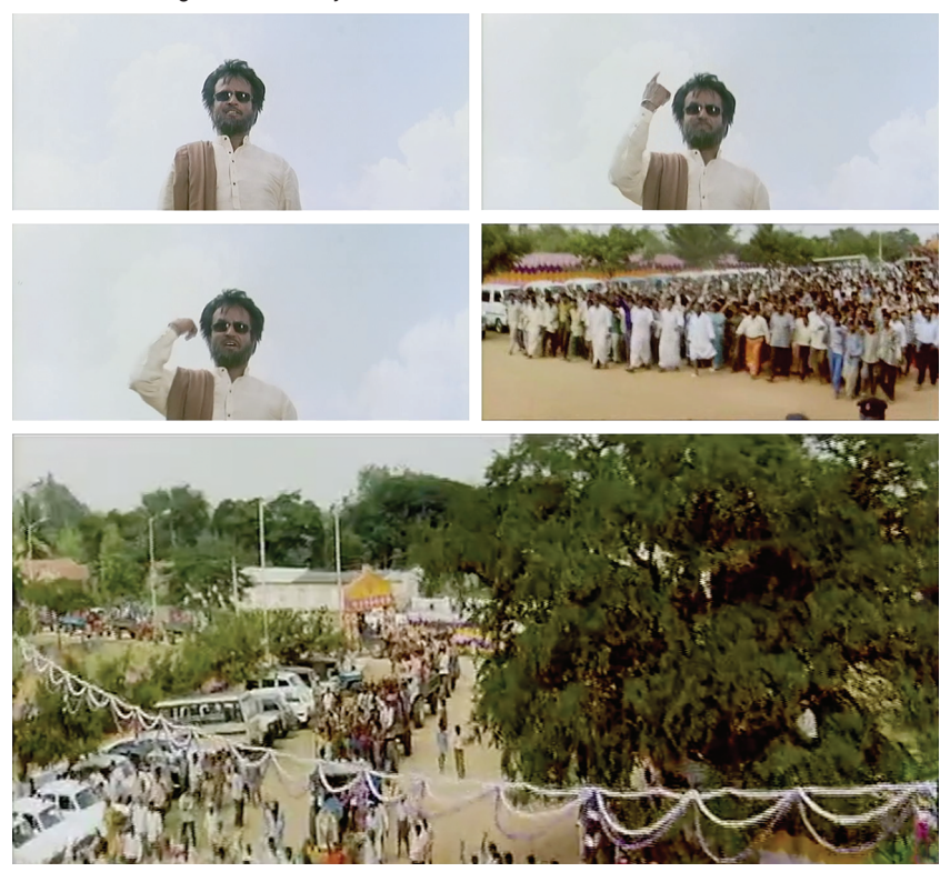
Figure 1. Rajinikanth's index finger in the preclimax of Padaiyappa (1999; director: K. S. Ravikumar).

even primarily) representations of characters in a film, nor even of his absent star body; rather, they are presencings of his being. This presencing constitutes Rajini's fingers as indexical signs of a particular sort: performatively potent fingers that not only deictically point in the diegetic world of the film but also point beyond it (as we will see, at the audience qua electorate) and that not only visually point but haptically touch, grab, and encompass their onscreen/offscreen objects (cf. Casetti [1983] 1995; Metz [1987] 1991), incorporating them into the very being of the ultimate ground of those indexical acts: Rajinikanth himself.