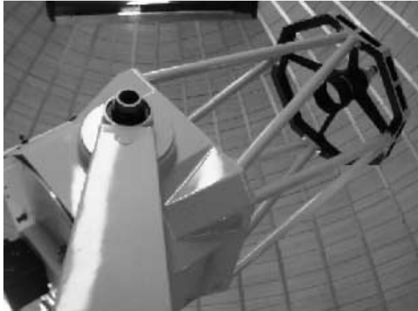
Figure 1 View of the IRAIT telescope at the Coloti observatory.

like ISO (the same will be true for future IR missions). The results can instead be reached today through surveys in near and mid-infrared wavelengths from Antarctica.