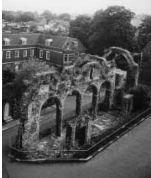
15. Canterbury, Christ Church Cathedral and Abbey hospital, 12th c.