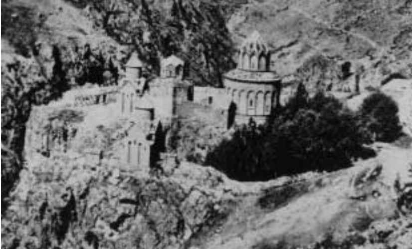
16 and 17. Khtskonk (Bes Kilise), St Sargis Monastery, 11th c., state in 1915, and Khtskonk, St Sargis Monastery, 11th c., view after 20th c. destruction