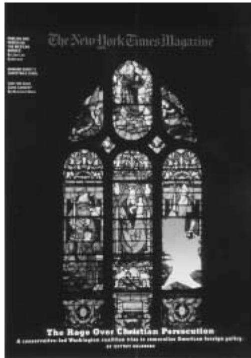
18. 'Rage over Christian persecution', photo manipulation of a stained glass window

In other ways too, acts of iconoclasm may have their own power beyond that of the original image, and this becomes part of their reception history. The damaged remains may be encoded as ruins that preserve the cultural memory of groups such as the Buddhist monks who once inhabited Bamiyan in Afghanistan, or the Roman Catholic monks in Canterbury before Henry VIII (figs 14 and 15). Divested of their original iconic and political power, such ruins may be valued as historical monuments by other peoples. Or, ruins can be trans-valued as relics, and thus inspire hatred of the perpetrator and sympathy for the group whose sacred precincts have been violated. The destroyed churches of Armenia, for instance, keep alive the memory of the persecution of Christians under Turkish rule. The photographs here document the disappearance of all but one of the 11th-century monastic churches and other buildings at Khtskonk (Bes Kalise) since 1915 (figs 16 and 17). 27 It is now reported that the dome of this church has collapsed.