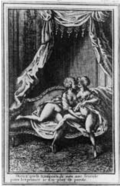
8. Anonymous print, La Vie Privée, Marie Antoinette with lady in waiting (Paris, Bibliothèque Nationale de France.)

The familiar charge of homosexuality was used against the queen (thus dubbed as adulterer as well as idolater). Circulated through prints, the pornographic image drained Marie-Antoinette of all regal presence, in marked contrast to the official court portraits; such base corporeality could not embody the realm (fig. 8). 21 Thus her public image was destroyed along with the public images of the king. After this physical destruction of the king's statues, and the character assassination of his queen, the icon of the king was displaced by one of Liberty enthroned (fig. 9). It then became necessary to dispose of the physical bodies of these once-royal persons (the living referents of 'king and queen' had become empty signs). And so in January and October 1793 they were beheaded under the gaze of Liberty (fig. 10). 22