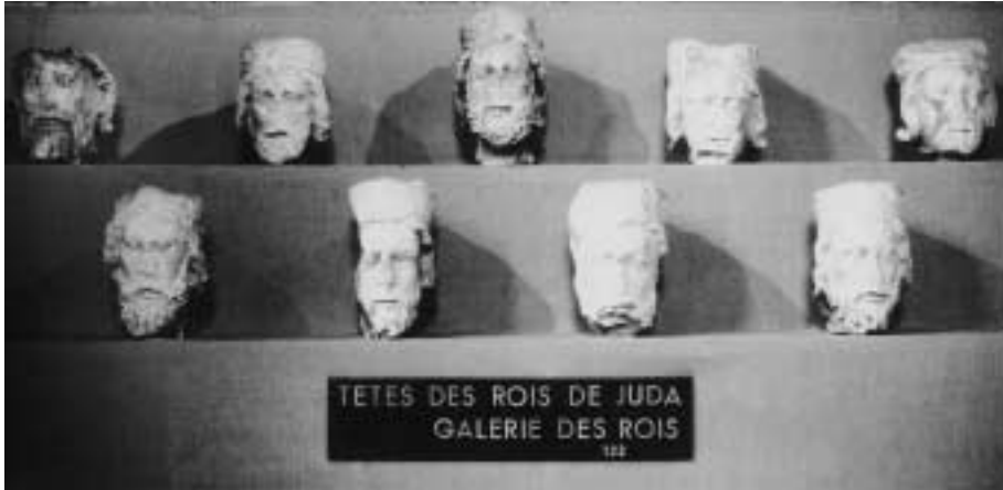
11. Group of nine kings' heads, limestone, from the gallery of kings in the west façade of Notre-Dame Cathedral, Paris, c. 1230–40. (Paris, Musée National du Moyen Age et des Thermes de Cluny. Photo: Madeline Caviness)