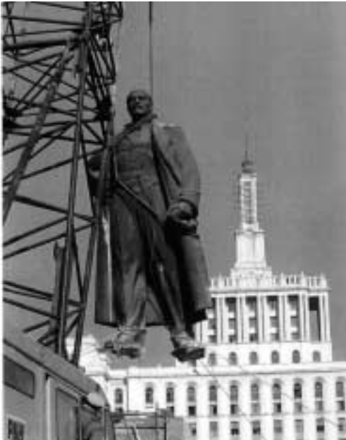
Fig 1 ‘Communist Icon is Uprooted in Bucharest’ – cranes lift a 25-foot high bronze statue of Lenin (after New York Times , March 6, 1990. Photo: AP/Wide World Photos/Michel Euler)

Iconophobia, literally the fear of images, usually occurs in proportion to the powers attributed to images by their believers and attackers. 1 In the worst cases, these fears have led to, or coincide with, a cycle of violence that may involve the actual destruction of images (iconoclasm) and the actual destruction of human life. The distinction between the two activities is often blurred by the language we use: For instance, purging public spaces of the giant statues of Soviet leaders in the early 1990s