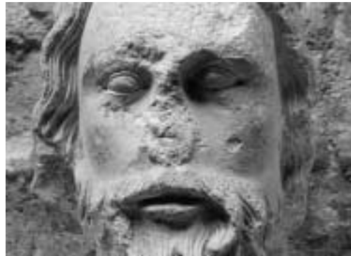
13. Detail of a king's head (#15) from the west façade of Notre-Dame Cathedral, Paris (Musée National du Moyen Age et des Thermes de Cluny.)