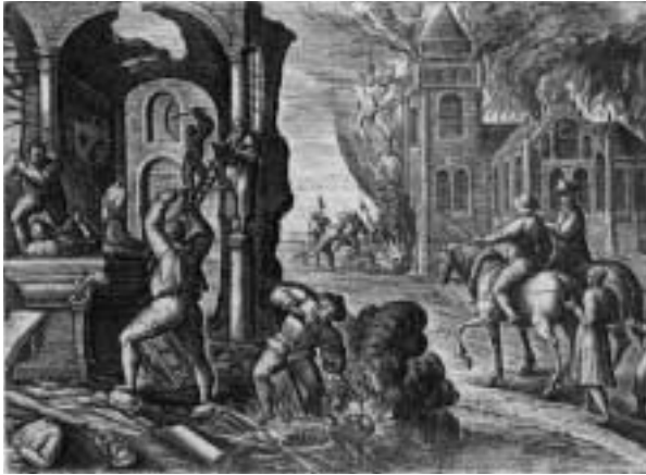
2. Anonymous print, Horribilia scelera ab Huguenotis in Gallijs perpetrata, Catholic view of Protestant crowd violence in France, 16th c. (after Richard Verstegen, Theatrum crudelitatum haereticorum nostri temporis. Antwerp: A. Hubert, 1588.)