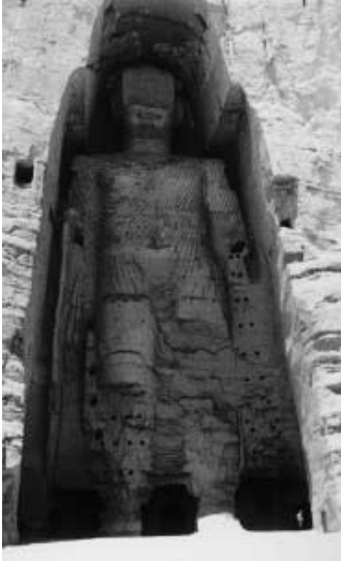
14. Bamiyan, Afghanistan, Buddha Cliff, 175 feet high, stone sculpture, 3rd–7th c.