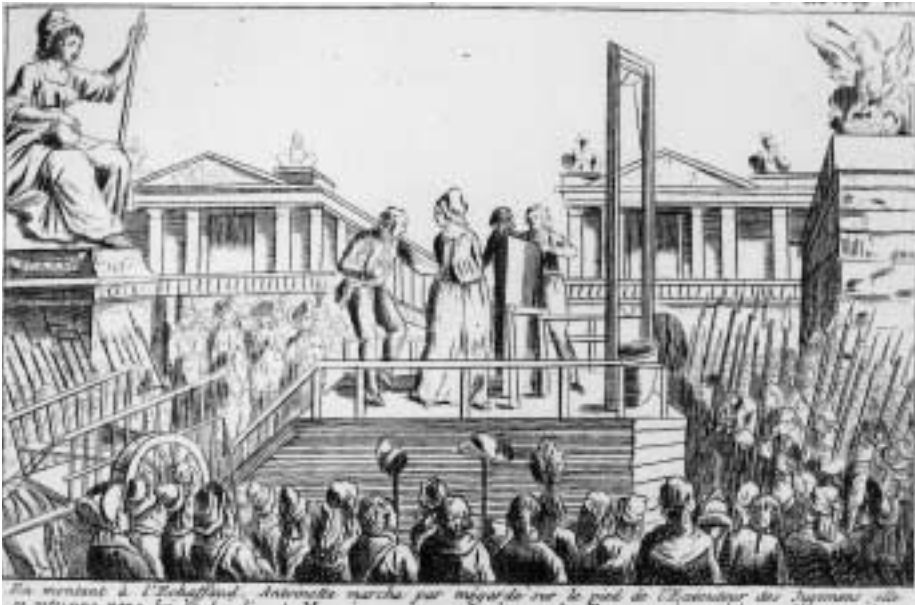
10. Anonymous print, Marie-Antoinette at the Guillotine, 1793 (Paris, Musée Carnavalet. Photo: © Photothèque des Musées de la Ville de Paris/Cliché: Toumazet)