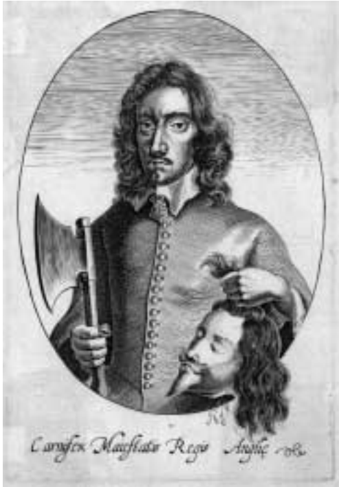
4. Anonymous print, Carnifex Maiestatis Regis Angliae, Charles I beheaded, 1649