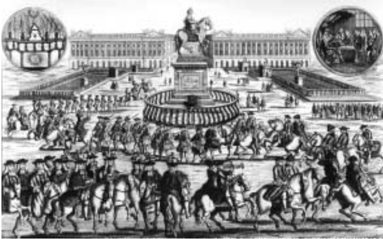
6. Jacques Ange Gabriel, print, Ceremonies observing a day of public peace in the Place Louis XV (Place de la Concorde) (Paris, Musée Carnavalet. Photo: © Photothèque des Musées de la Ville de Paris/Cliché: Degraçes)