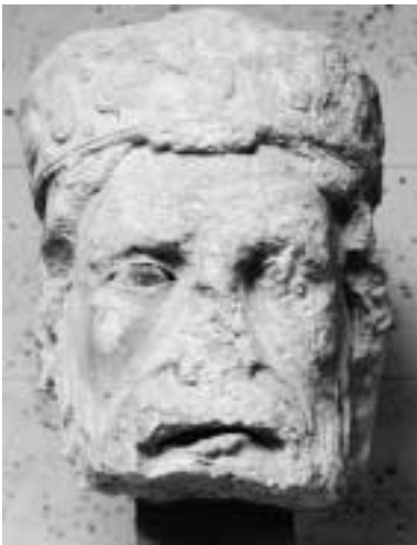
12. Head of King David (#20) from the the west façade of Notre-Dame Cathedral, Paris (Musée National du Moyen Age et des Thermes de Cluny.)