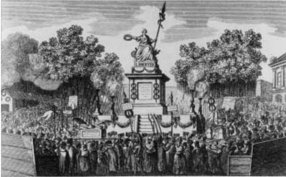
9. Anonymous print, Festival of Liberty, October, 1792. ( Revolution de Paris #71)