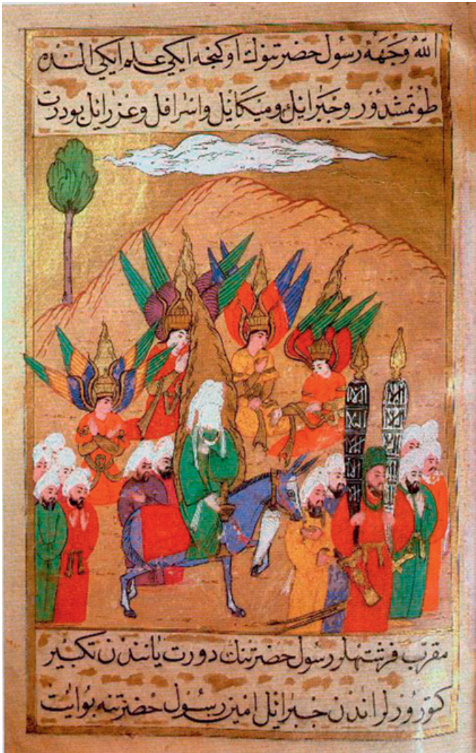
Figure 1 A depiction of Muhammad (with veiled face) advancing on Mecca from Siyer-i Nebi , a sixteenth-century Ottoman manuscript. The Prophet and his companions are attended by the angels Gabriel, Michael, Israfil, and Azrail.

Siyer-i Nebi: The Life of the Prophet 1595. Hazine 1223, folio 298a.