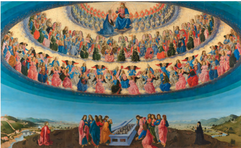
Figure 2 The Assumption of the Virgin by Francesco Botticini (1475–76), showing three hierarchies and nine orders of angels, each with different characteristics.

Finicking over the celestial hierarchy may thus seem to court self-contradiction, when it is in fact working both sides of a paradox. We are urged to see that the universe is at once tuned to the n th degree, and by symmetries that are themselves theologically significant (notably, by 3s, 7s, and 9s), but also to recognise that it is ultimately beyond our ken. Similarly, when the size and shape of individual angels is glossed in categorical terms, the precise scale is not so germane as the idea – the divine reassurance and glory – of purposeful precision itself (see Figure 2).