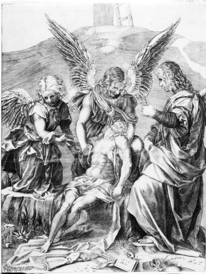
Figure 3 Agostino Veneziano, Pietà (engraving), after Andrea del Sarto, Puccini Pietà [1516].

The language of angelology in visual art thus tessellates with the ciphers of mathematics, because numbers too are deployed in a way that is essentially symbolic, to accent this or that feature. But numerical calculation does extra work as well, for the very reason that its language is more typically associated