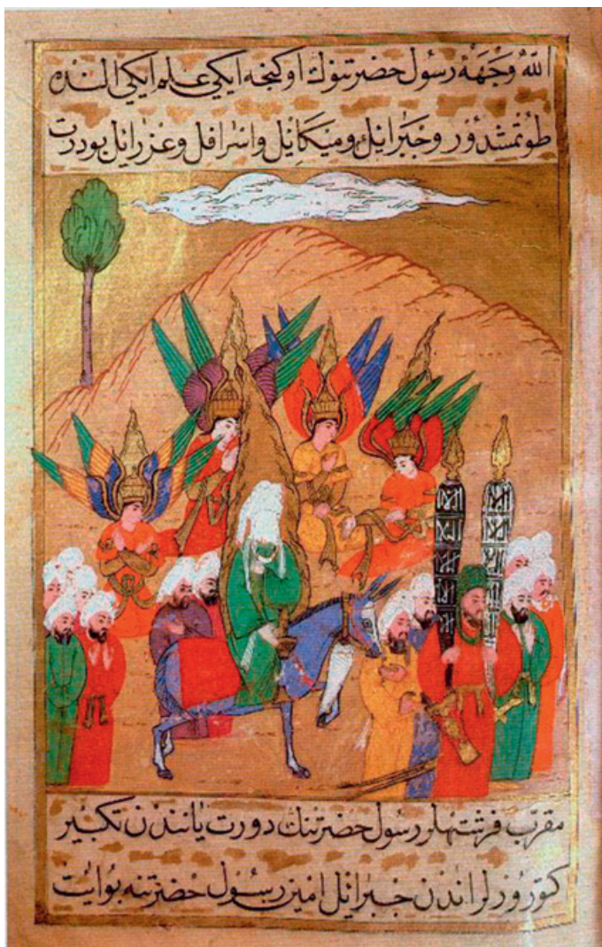
Figure 1 A depiction of Muhammad (with veiled face) advancing on Mecca from Siyer-i Nebi , a sixteenth-century Ottoman manuscript. The Prophet and his companions are attended by the angels Gabriel, Michael, Israfil, and Azrail.

Siyer-i Nebi: The Life of the Prophet 1595. Hazine 1223, folio 298a.