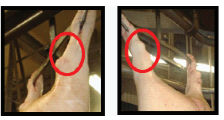
Hind-limb bursitis (absent/mild and severe, left to right).

approach, it was possible to subsequently capture the carcase weight and grade of each study pig. The carcase weight of a pig corresponded to the cold weight following bleeding and removal of the internal organs (including genitalia), tongue, bristles, hooves and flare fat (Irish Central Statistics Office 2012).