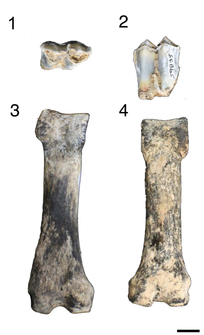
Figure 4. Pleiolama sp. indet. from McKay Reservoir: (1, 2) right m1 or m2 (SDSM 59835): (1) occlusal view; (2) lateral view; (3, 4) proximal phalanges in plantar view: (3) UOMNH F-81112; (4) UOMNH F-4154. Scale bar = 1 cm.

removing the occurrence of Neohipparion from the faunal list for McKay Reservoir.