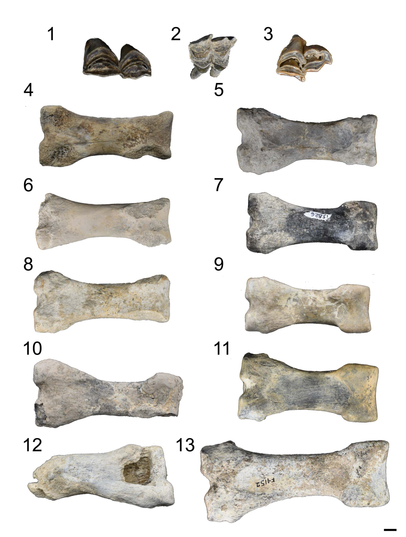
Figure 3. Megatylopus sp. indet. from McKay Reservoir: (1) left m1 or m2 in occlusal view (UWBM 61682); (2) left M1 or M2 in occlusal view (UOMNH F-81109); (3) right M3 (SDSM 51260); (4–13) proximal phalanges in plantar view: (4) UOMNH F-81111; (5) UOMNH F-81110; (6) UCMP 113536; (7) SDSM 15826; (8) UOMNH F-4153; (9) SDSM 28013; (10) SDSM 12812; (11) UMNH F-3843; (12) UOMNH F-71508; (13) UOMNH F-4152. Scale bar = 1 cm.