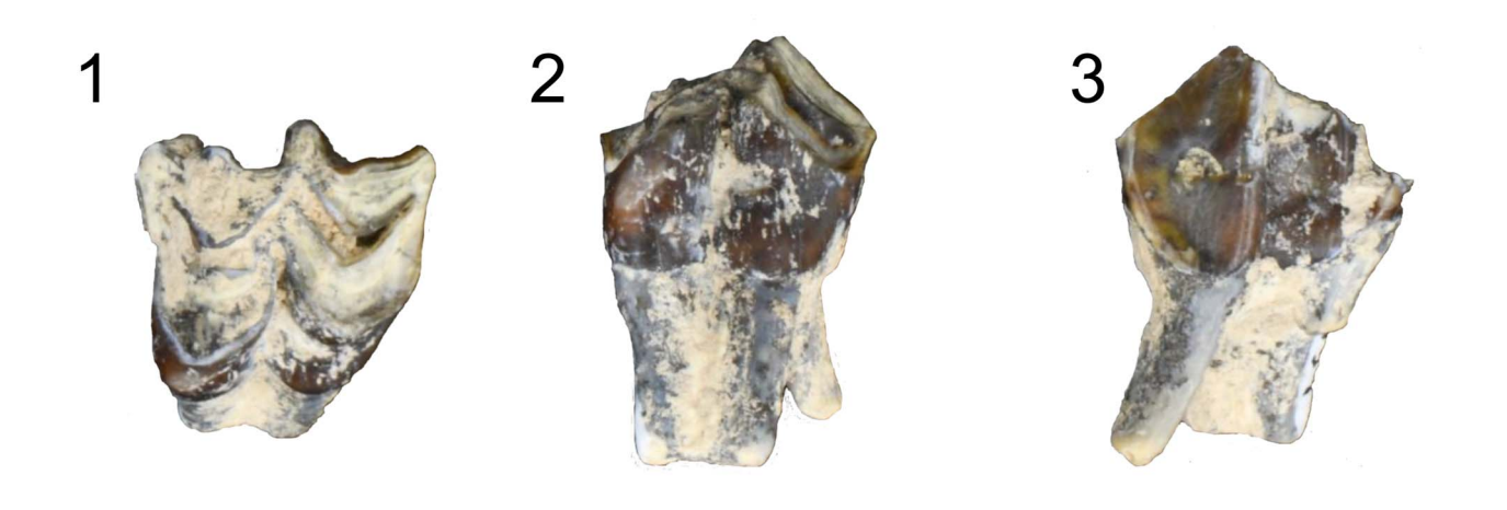
Figure 5. Dromomerycidae gen. indet. sp. indet. from McKay Reservoir, left M1 or M2 (SDSM 38459): (1) occlusal view; (2) medial view; (3) lateral view. Scale bar = 1 cm.