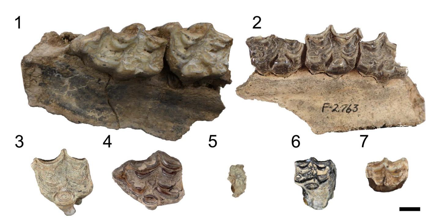
Figure 6. Equids from McKay Reservoir: (1–5) Cormohipparion sp. indet., upper dentition: (1) left maxilla fragment with P2–P3 in occlusal view (UWBM VP 61653); (2) right maxilla fragment with P2–P4 in occlusal view (UOMNH F-2763); (3) left upper cheek tooth other than P2 or M3 in occlusal view (UOMNH F-2787); (4) left upper cheek tooth other than P2 or M3 in occlusal view (UWBM VP 61573); (5) left upper cheek tooth fragment in occlusal view (UOMNH F-4156); (6) Pseudhipparion sp. indet., right upper cheek tooth other than P2 or M3 in occlusal view (UOMNH F-4156); (7) Equinae gen. indet. sp. indet., buccal half of upper cheek tooth other than P2 or M3 in occlusal view previously assigned to Neohipparion (UOMNH F-4444). Scale bar = 1 cm.

with the species means of previously described species (Table 3). Furthermore, for specimens with multiple teeth, the most similar species varied with tooth position. UOMNH F-2787 is most comparable in size to Cormohipparion skinneri but is still fairly far off. The dimensions of