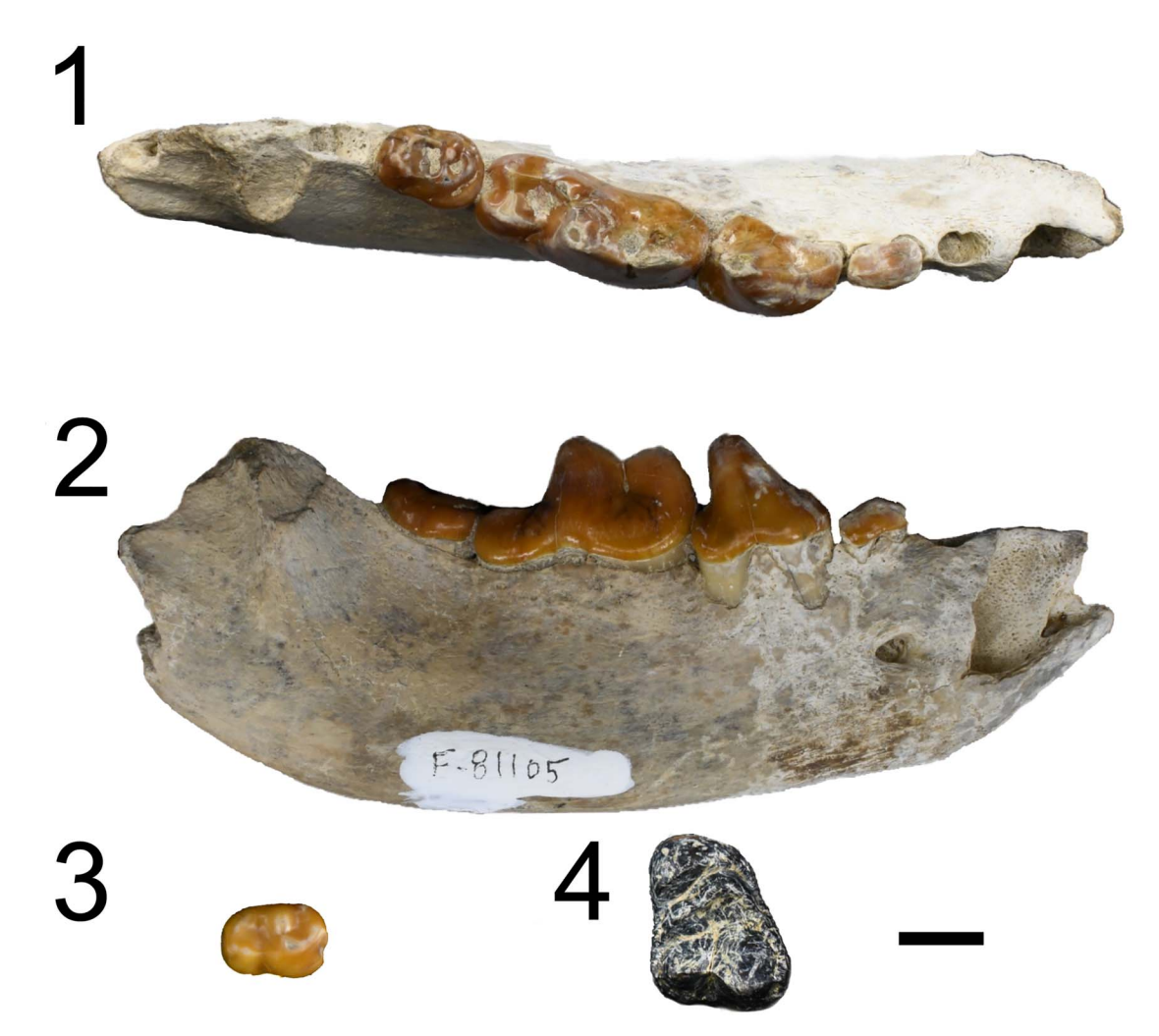
Figure 2. Borophagus secundus (Matthew and Cook, 1909) from McKay Reservoir: (1, 2) right dentary (UOMNH F-81105): (1) occlusal view; (2) lateral view; (3) right lower m2 (UOMNH F-81106); (4) left upper M1 in occlusal view (UOMNH F-29746). Scale bar = 1 cm.

Description. —Large size of teeth and presence of small m2 on UOMNH F-81105 and F-81106 suggest that specimens can be