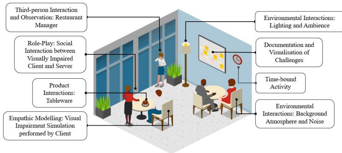
Figure 3. Empathic empowerment key mechanisms (generated using IcoGrams®)

The Empathic Empowerment Scale demonstrates the fantastic capability of humans to comprehend the physical and emotional needs of another person following a situated interaction. Level 4 challenges reported by the servers in Table 3 were an expression of empathy towards the client, whereas those expressed by the clients on the same level of ranking were more self-oriented. Despite this, when asking the servers to infer the challenges experienced by the clients, level 4 challenges expressed by the client in Table 2 proved harder to identify. This could be due to the inner monologue of the client that was not verbalised, or the lack of eye contact limited by the glasses worn by the client and requires further investigation. This also indicates the value of a third person for observing and analysing the interaction. The clients were also able to express level 4 challenges to a third person more openly - in this case - the restaurant manager and researcher.