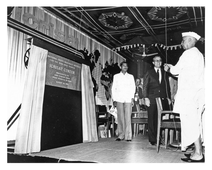
Figure 2.2 Prime Minister Charan Singh at the dedication of ICRISAT in 1979.

in which small farmers in rainfed areas had to be pulled up economically. He mentioned the dependence of 70 percent of the country's agriculture on uncertain rains and thus underlined the importance of ICRISAT in addressing this vast geography and "helping the farmers who are dependent solely on rainfall." Meanwhile the chief minister, Reddy, thanked ICRISAT for choosing his state as its location. An element of regional pride suffused Reddy's adulation as he emphasized the importance of Andhra Pradesh in Indian agriculture.<sup>40</sup> In short, a tenuous alliance seemed to exist over ICRISAT. This secured its place as an Indian, as well as an international, institution.