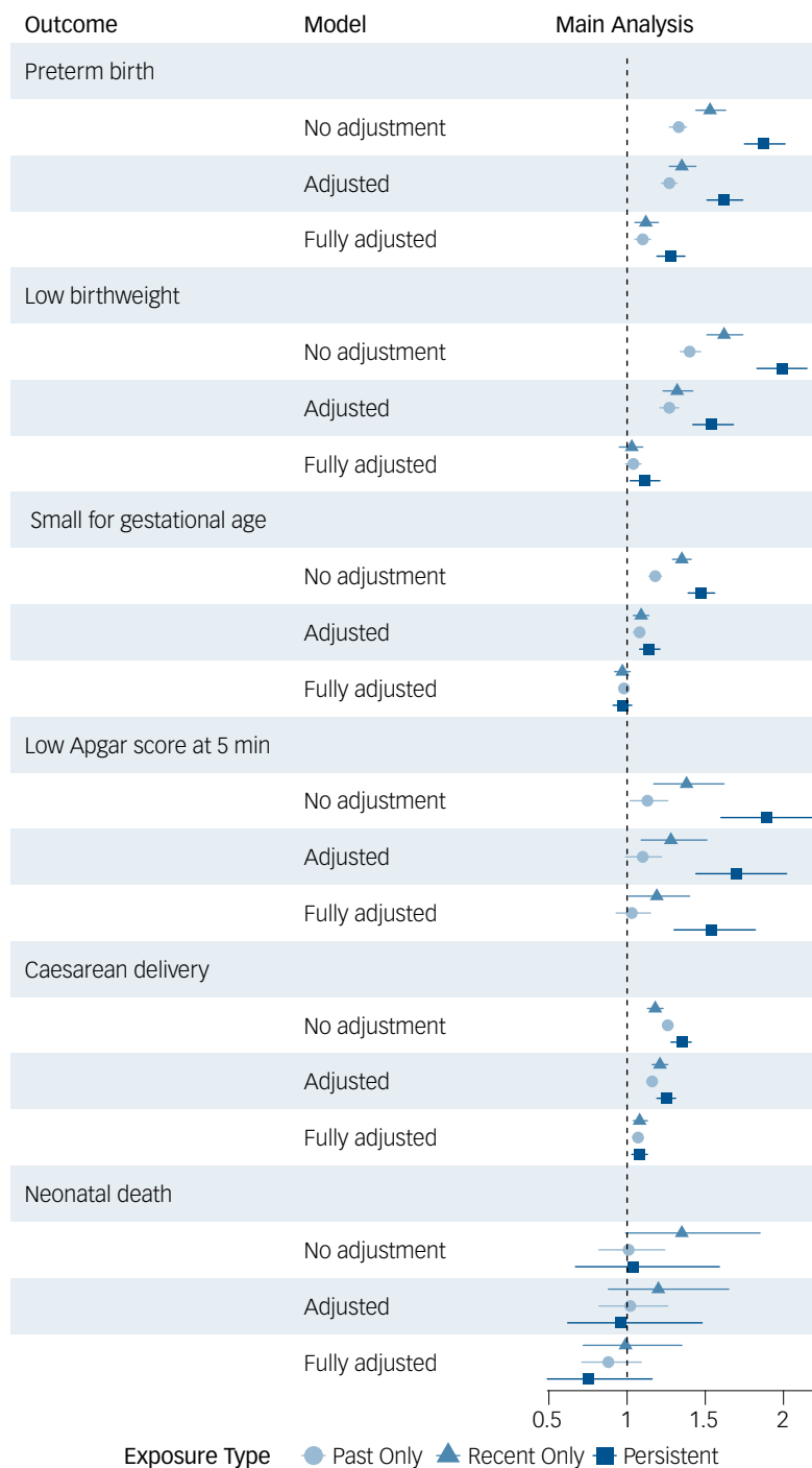
Fig. 2 Adjusted odds ratios for the associations between maternal mental disorder diagnoses and birth outcomes. Crude: no adjustments. Adjusted: adjusted for maternal age at delivery; marital status; highest education; calendar year of delivery. Fully adjusted: adjusted for maternal age at delivery; marital status; highest education; calendar year of delivery; number of non-psychiatric hospital visits during pregnancy; smoking during pregnancy; pregnancy complications.

Mental disorders are associated with various risk factors, including risky health behaviours. 21 Several of these factors are also associated with adverse outcomes and may mediate associations between maternal mental disorders and neonatal outcomes. Prenatal exposure to tobacco smoke is an obvious covariate of interest. Women with mental disorders are more likely to continue smoking throughout pregnancy than women without mental disorders. 22 The effect of smoking during pregnancy is clear, with evidence consistent that it increases the risk of a range of adverse birth outcomes. 23 Alternatively, these associations may