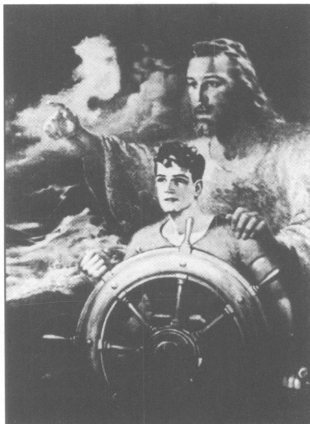
From Visual Piety