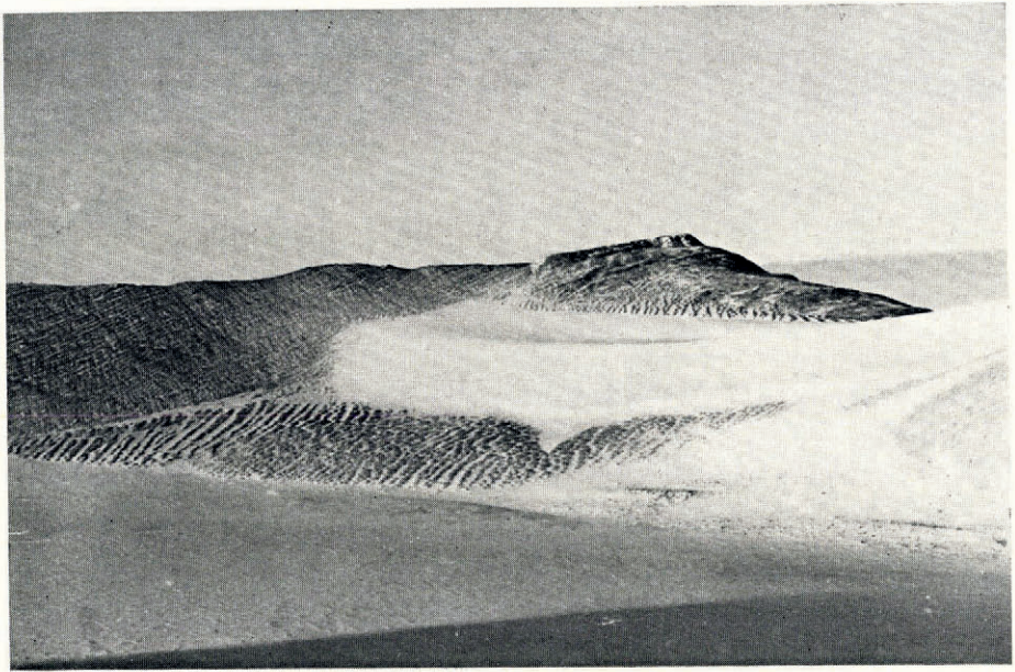
Fig. 1. Patterned ground on a mountain in the Shackleton Range, October 1957. Note the abrupt interruption of the patterned ground against the margins of the smaller ice field