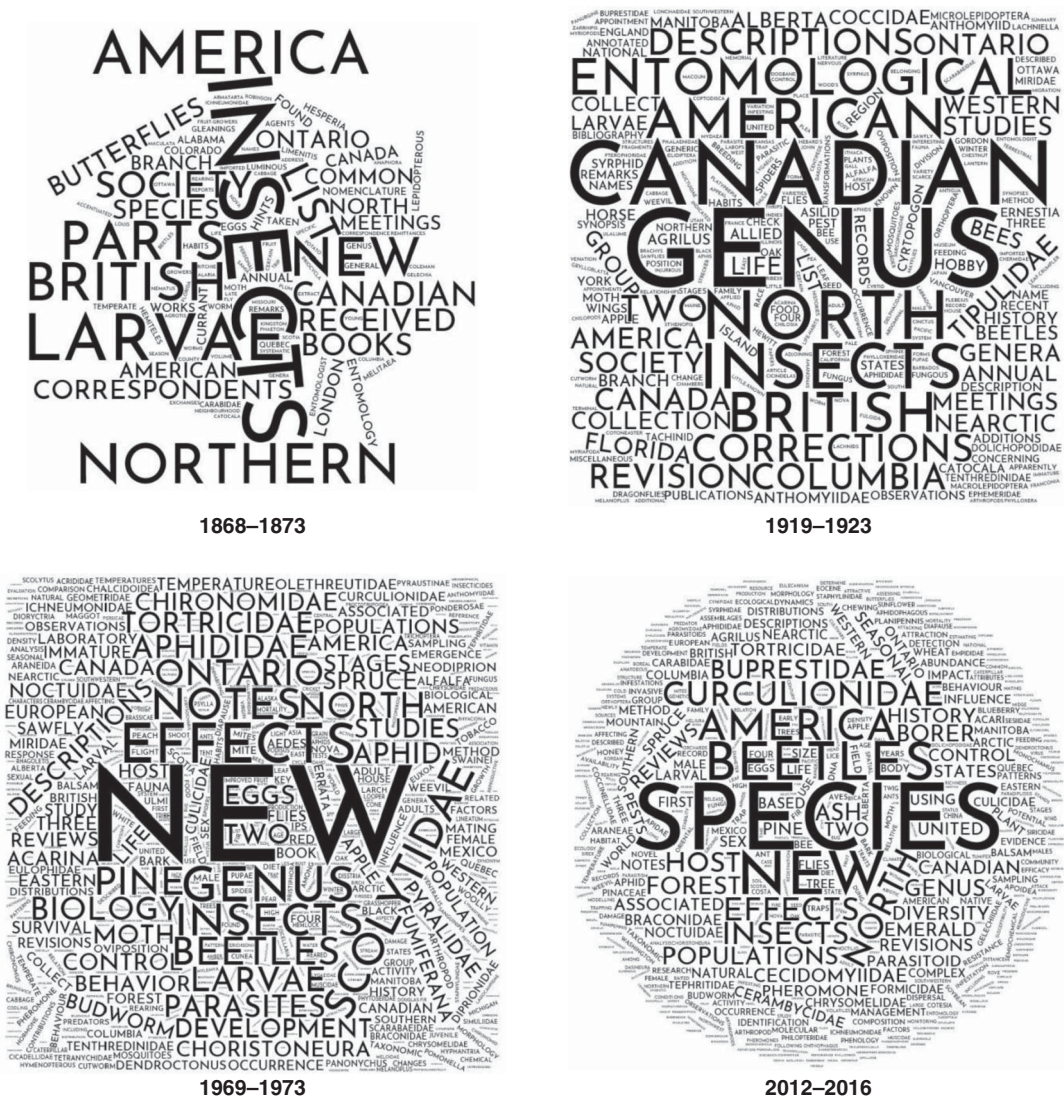
Fig. 3. Word clouds illustrating topics and taxa during four time intervals in the history of The Canadian Entomologist .

With these most recent changes, time from submission to final decision can be less than a day. Each submission is given a preliminary assessment to determine whether it meets the mandate of the journal, whether the writing quality is sufficiently clear to allow for a critical scientific review, to ensure that all figures and tables are included, and to assess potential plagiarism. About one-third of submissions are rejected at this stage with the authors being notified within a few days. A further one-third of submissions are rejected after a full review. Time from submission to final decision for all manuscripts has averaged 43 days in recent years