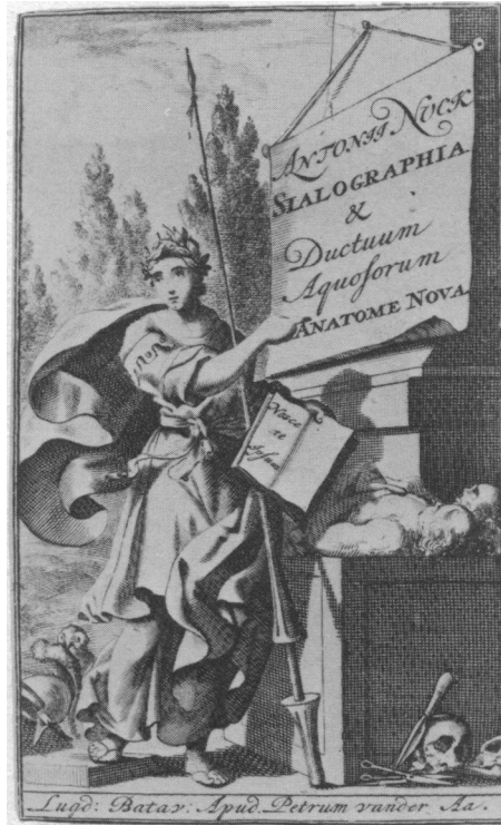
Figure 11. Minerva holding a book inscribed in Latin "know thyself", anonymous engraving for A. Nuck, Sialographia , Leiden, 1690, title-page. (See p. 83.)

20.1 Oil painting by Rembrandt van Rijn, called 'The anatomy of Dr. Nicolaes Tulp', 1632. See pp. 31–38 above and Pl. I above.