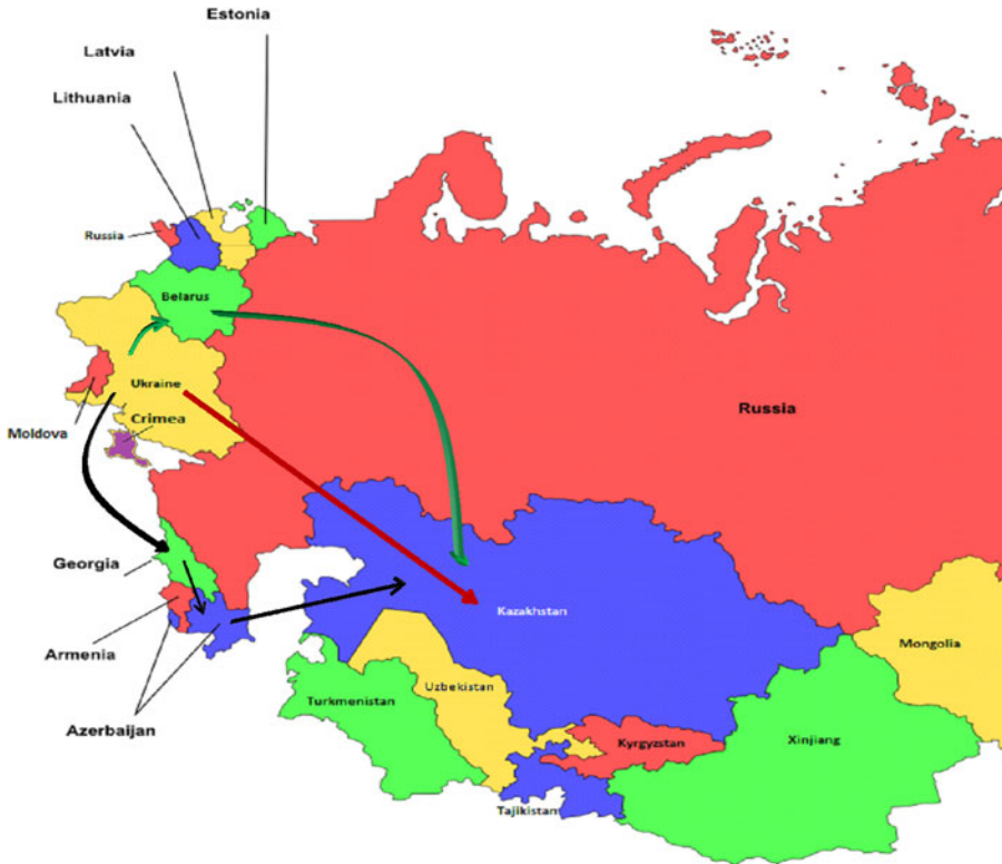
Figure 1. Transit routes from Ukraine to Kazakhstan