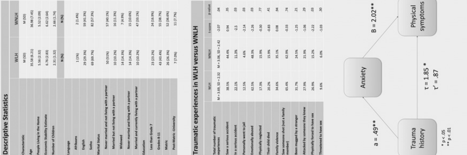
Figure 12.2 Sample poor and good slides for an oral presentation.