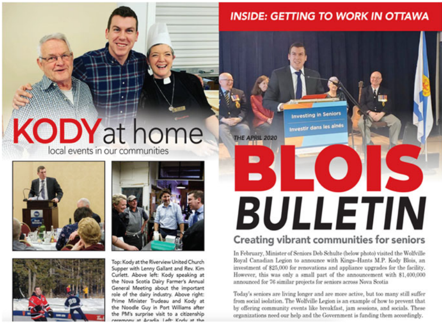
Figure 1. Householder front page (householder of Liberal MP Kody Blois, Kings-Hants, April 2020)

this time, constituency casework skyrocketed as MPs and staff assisted constituents in distress and those who needed help accessing emergency government programs (Koop et al., 2020). However, MPs were unable to attend the public gatherings and events that are content fodder for householders.