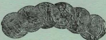
Gold Medal Allahabad 1910.

Paris 1900, Brussels 1910, Buenos Aires 1910.