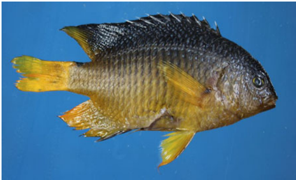
Fig. 1. Stegastes variabilis (HUJ 21202), 83.2 mm (SL), 29 April 2022, speared at 4 m near Caesarea at the Mediterranean coast of Israel.