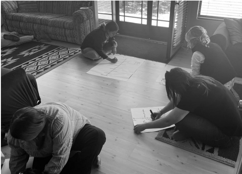
Photo 1. University workshop group creating environmental identity timelines.