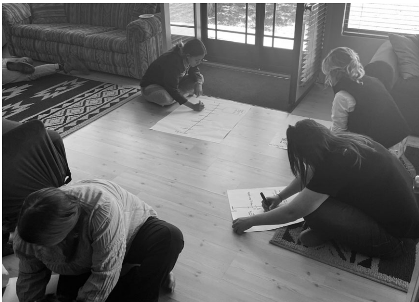
Photo 1. University workshop group creating environmental identity timelines.