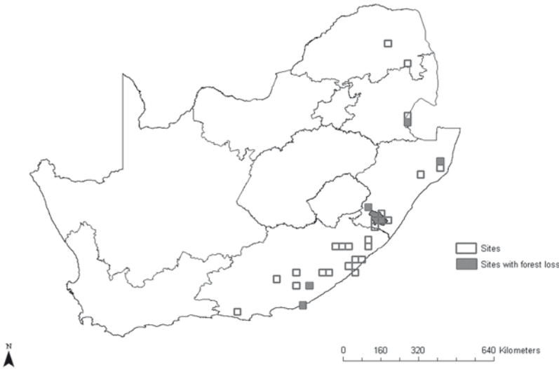
Figure 1. Sites across South Africa that experienced a loss of 20% or more of forest-dependent bird species between the two South African Bird Atlas Project (SABAP) periods of 1987–1992 and 2007–present. Filled in sites indicate those that experienced a loss of indigenous forest during this period. The grey shaded area represents the former East Griqualand.