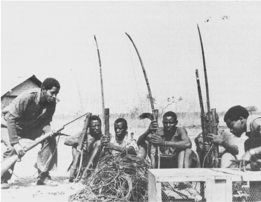
Poachers arrested in October 1979 in the Endulen Zone of the Ngorongoro Conservation Area. The cage holds Fischer's lovebirds to be sold to permit holders in Dar Es Salaam who export them to Japan, Germany, UK, USA and Canada.

poachers easily enter the MGR or cross the western boundary of the NCA.