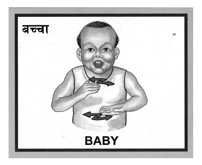
Figure 2. Nepali Sign Language poster featuring the sign baby

In addition to making the effort to travel around the country to paint (or repaint, following earthquake damage) such murals on classroom walls, Shakya has also created representations of NSL forms, signers, referents, and written glosses for dictionaries, posters, and textbooks that are published by Nepali associations of deaf persons and integrated into sign language teachers' lessons in classes for deaf students throughout the country. These materials serve as public