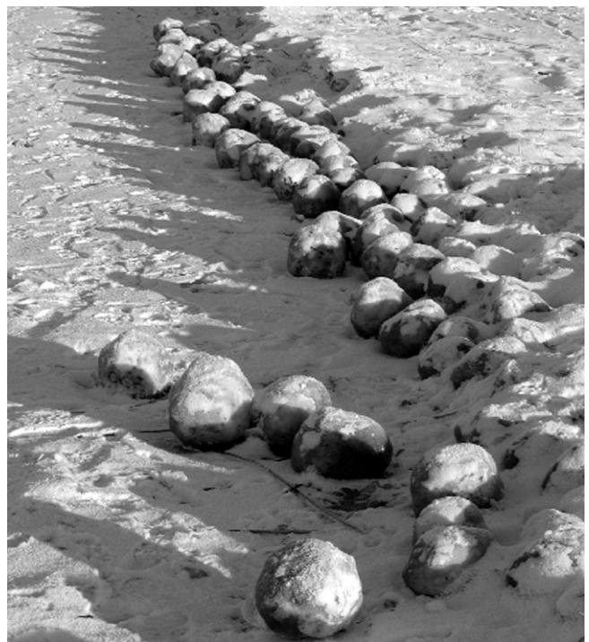
Fig. 2. Close-up of the uppermost tidal terrace with ice balls. The ice ball at the bottom is about 25 cm in diameter.