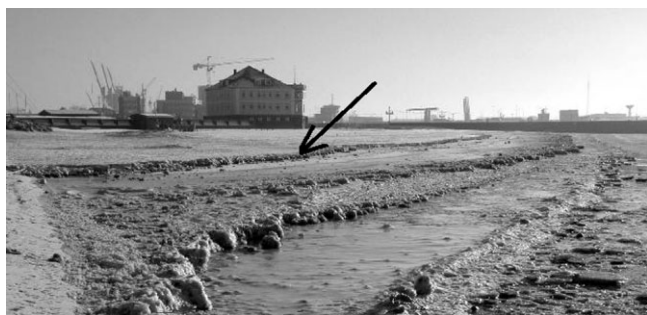
Fig. 1. View of the beach with several tidal ice terraces. The arrow indicates the position where the Figure 2 photograph was taken.

Density variations were derived from microcomputer tomography. The pore volume of the inner core was strongly connected within the ice matrix. It amounted to \sim 50\% which leads to a density of around 400 \text{ kg m}^{-3} . The density of the outer shell was close to the density of ice, without any significant pore structure.