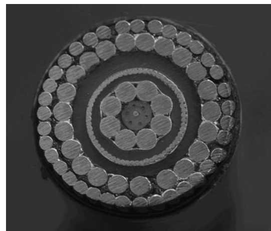
Fig. 2. Cable cross-section as built.

assumes 1000 drill runs where the cable travels through four sheaves on the way down or up. With a safety factor of 3, 1000 drill runs yields a result of 24 000 bends in the cable life. The DISC drill cable successfully passed a fatigue test performed by Rochester Cable in which a 30 m piece of cable was wrapped around a sheave for 25 000 cycles at -55^\circ\text{C} . The most important cable requirements are summarized in Table 2.