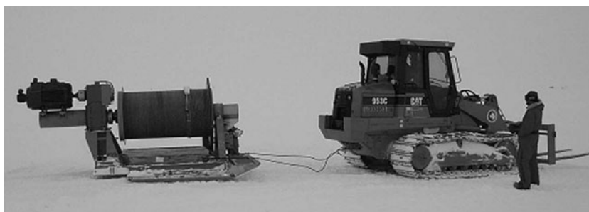
Fig. 3. Cable on winch at WAIS divide.

have very good optical sensitivity but are limited to only a 38 400 baud rate. This baud rate is fast enough to handle low-bandwidth signals.