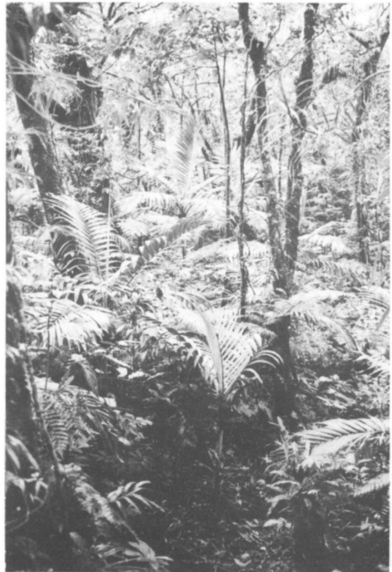
Top right: Potential nesting habitat; thick ridge forest with an abundance of Physokentia rosacea palms (Dick Watling). Bottom: View of the interior of Gau, showing rugged hills clad with mature rain forest (Dick Watling).