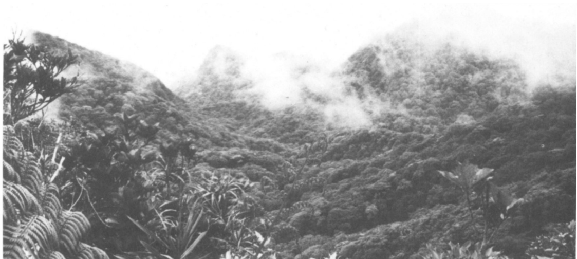
Gau Island: a rediscovered petrel