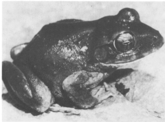
Fiji ground frog (Paddy Ryan).

The reptile fauna of Gau is rich, despite the presence of feral cats. We found the banded iguana Brachylophus fasciatus , and an undescribed species of Emoid skink, both of which are probably common on the Island, as well as Fiji's largest gecko Gehyra vorax . A major finding was the discovery of a population of the endemic Fiji ground frog Platymantis vitianus . The ground frog still manages to survive on the mongoose-infested islands of Viti Levu, Vanua Levu and Beqa, but these populations must be considered doomed in the long-term. Only the populations on Taveuni and Ovalau, and now on Gau, can be considered secure from this predator. However, the Gau population alone faces no competition from the cane toad Bufo marinus , which has been introduced and is abundant on Taveuni and Ovalau, but not on Gau.