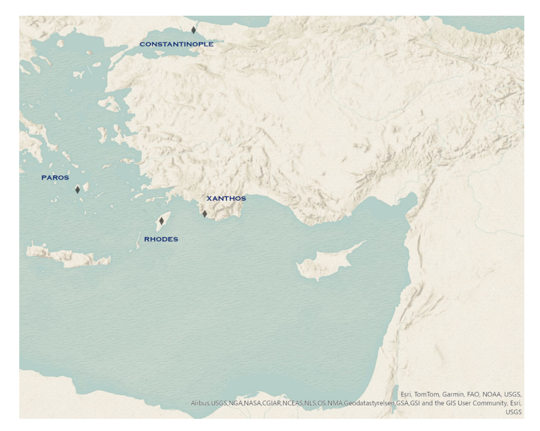
Fig 1. Mediterranean and Aegean. Working at Xanthos, the closest British consul was on Rhodes. Map: by the author.

bring attention to some of the vital contributions made to the development of archaeology by people of professions that posterity has seldom associated with intellectual pursuits. Before embarking on the narrative of the first Xanthos expedition through previously unexamined archival material, this paper will address the imperial context necessarily bound up in a government-backed expedition and consider where the Xanthos expeditions fit into nineteenth-century archaeology.