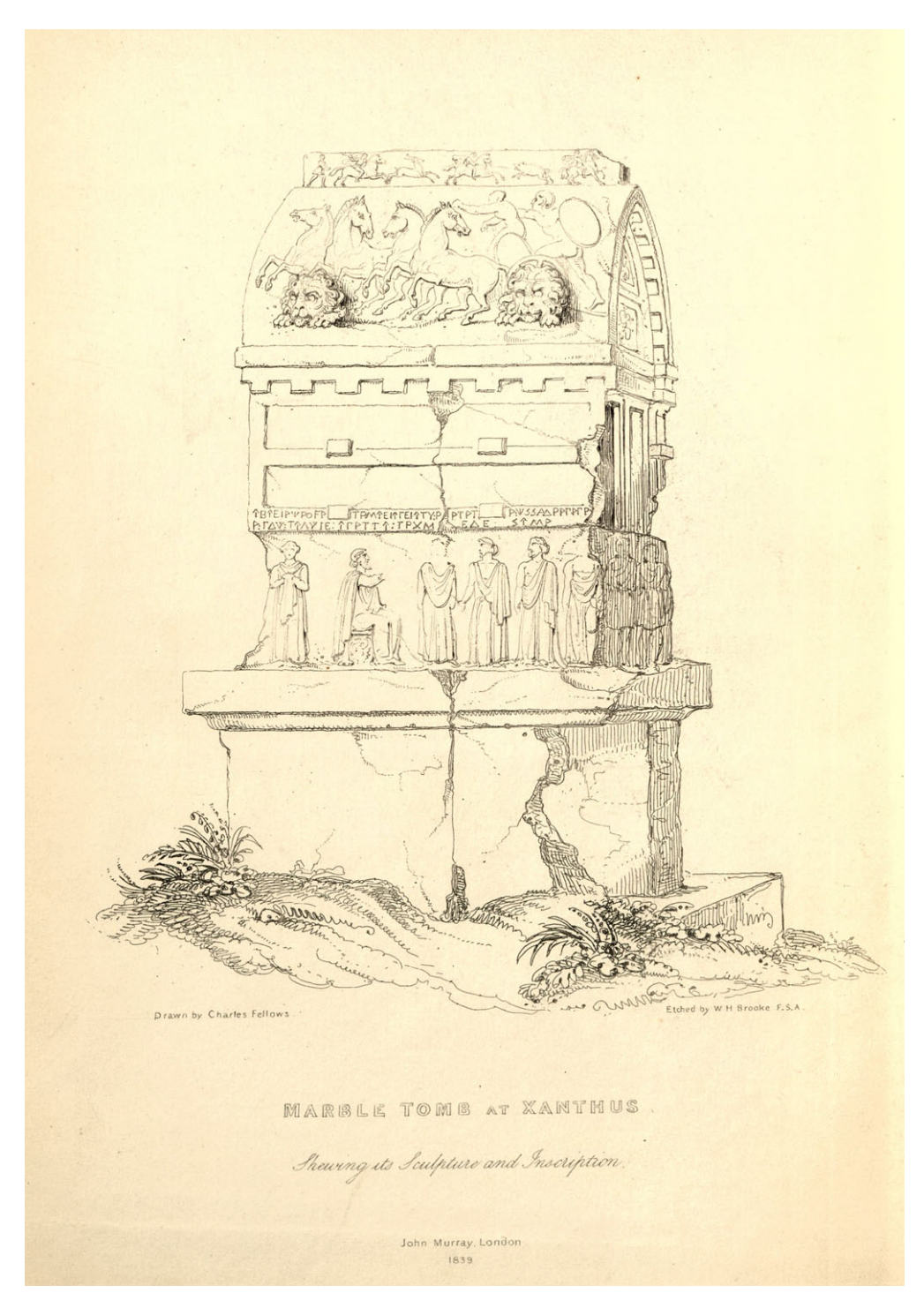
Fig 2. Payava's tomb as illustrated by Fellows in the frontispiece of his 1939 publication.