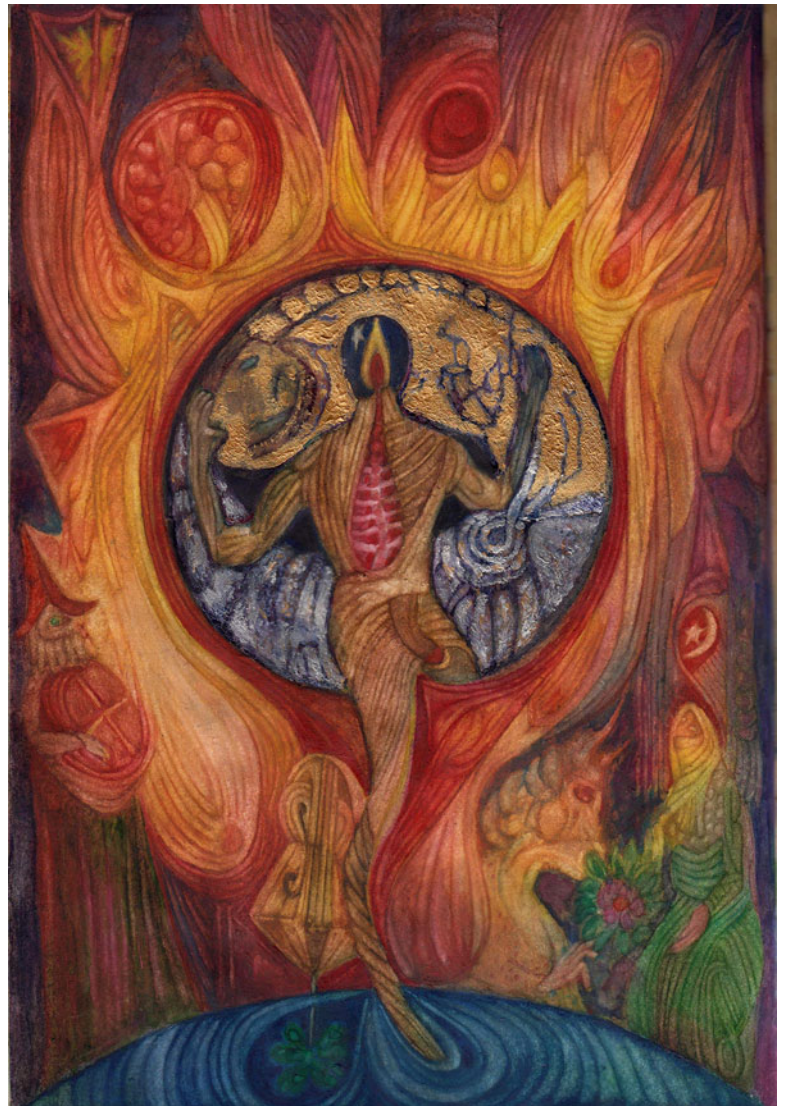
Figure 3. Goran Stojčetočić, Anthropos Autopsis (the Book of Visions) , page 17, 2022, watercolour on paper, 30 × 20.5 cm.