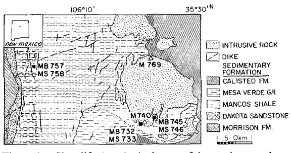
Figure 1. Simplified geological map of the study area showing sample locations. Solid circles are Mancos bentonite-shale sample pairs. Open triangles are Cerrillos pluton samples.

ordered I/S with 65–90% illite layers. Nadeau and Reynolds (1981) interpreted the illitic (potassium) bentonites to have formed from smectitic bentonites in response to the contact metamorphism.