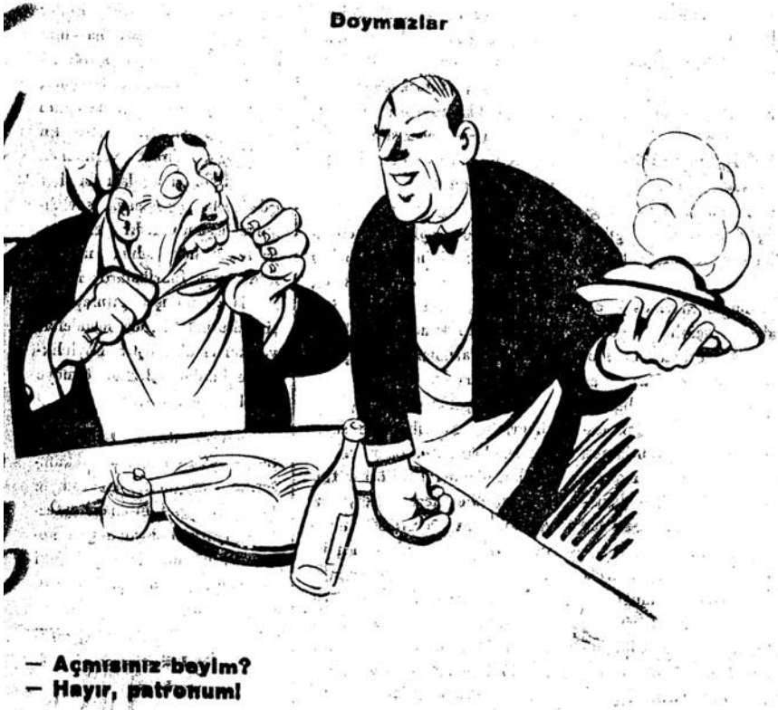
Figure 2. İşçi Sesi (Bursa) , no. 14, “They don’t get full”. “Are you hungry, Sir?” “No, I am an employer.”

workers’ problems (Figure 4, for example, ridicules the indolence of local labor agencies). In August 1951, a worker newspaper wrote furiously that the Ministry of Labor and local labor agencies had lost the promptness and interest they once had at the beginning of the period. 33