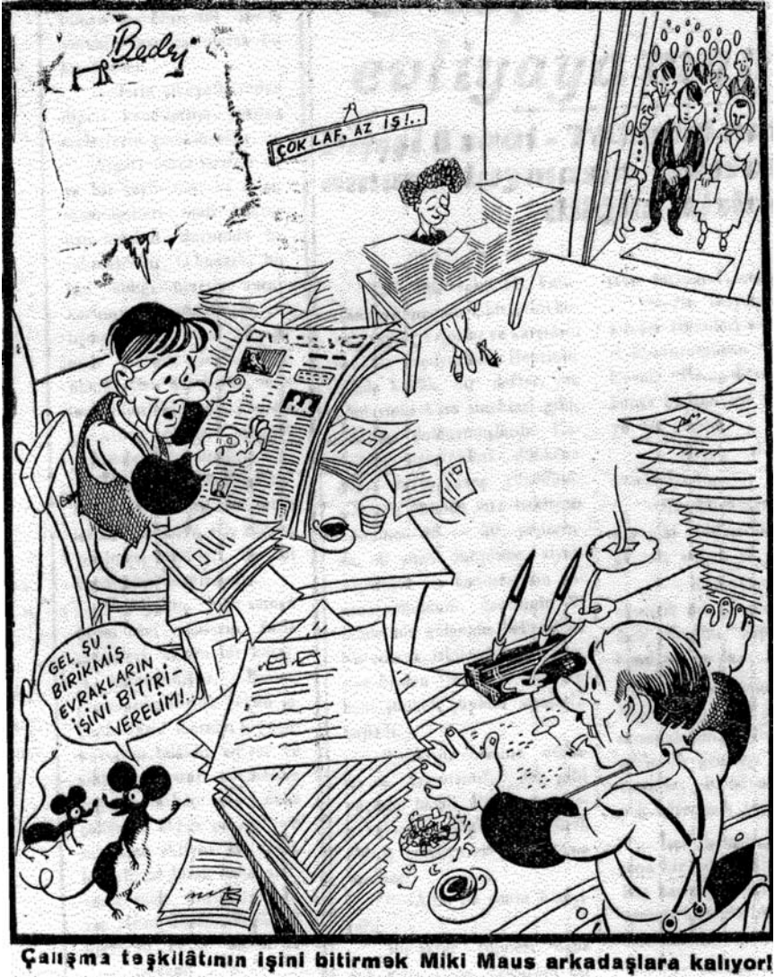
Figure 4. İşçi Sesi (Bursa), no. 12, “The duty of finishing the job of the Labor Agency falls to Mickey Mouse friends.”

“Come, let’s finish those accumulated documents.”