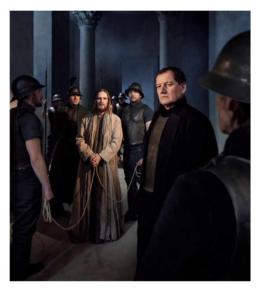
Fig. 2 The captured Jesus, held by Roman soldiers, stands before the powerful Pontius Pilate.

Other changes may be very significant to locals, though may not appear tremendously consequential to outsiders. The play's action has always been punctuated by choral music, and the choir has always (or at least since 1811) been accompanied by a narrator, called the Prologue, who explains the theological significance of the action in prose. But the Prologue, for the first time, was cut entirely in 2022: the 2022 audience is left to interpret the action for themselves. And the choir, which had previously been costumed all in white, giving an angelic aesthetic, are now costumed in 2022 like seventeenth-century Bavarian villagers: they represent the original Oberammergauers who started this tradition (Fig. 4).