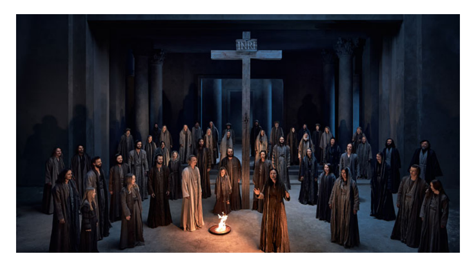
Fig. 5 The 2022 Oberammergau Passion Play stages the Resurrection without a resurrected Jesus physically present. Mary Magdalene, pictured downstage centre, looks out over the audience and declares that Jesus has returned. Near her stands an angel, who has brought on a giant flame, and around them stand the choir. The choir, here representing a subset of the larger community, ultimately take out candles and light them from the giant flame, before exiting.

friend, as a gesture of forgiveness and acceptance. He tried it out in rehearsal, spontaneously, and then kept it, with the approval of the director.<sup>52</sup> Another performer told me that the actors, in small groups, were constantly initiating smaller, subtler adjustments, on their own initiative, as they discussed problems and attempted to solve them. So, for example, at one of the final rehearsals, the group of actors playing apostles got together with the group of Temple Guard soldiers to discuss and rework the sequence of events at Jesus' arrest. 53 He said that he does not think they initiated changes on their own quite so much in past iterations, but that now, there is such an embrace of experimentation as a way of working that they do so organically.