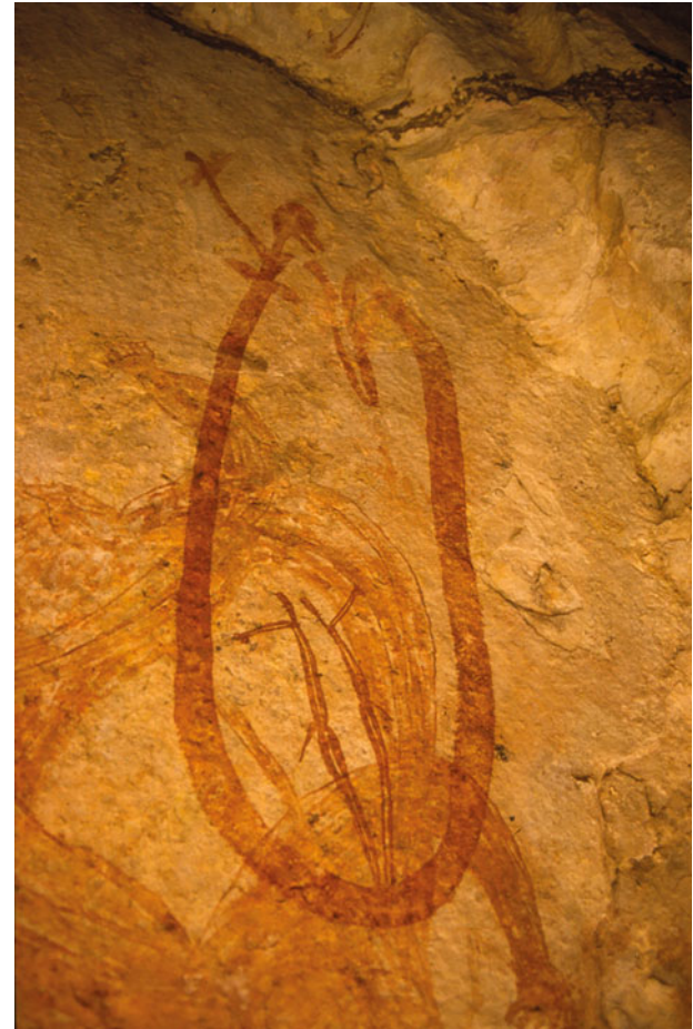
Figure 5. Djuwarr Rainbow Serpent with back-to-back human male figures, Deaf Adder Gorge, Kakadu National Park.

(Chaloupka 1993, 188, fig. 209), a second composition by Nayombolmi of a 'split man' (Nakurrurndilhba) back-to-back figure about to have intercourse with a normal female figure, two back-to-back malevolent female spirits at Nanguluwurr, Kakadu (Hayward et al. 2021, 422, fig. 11) and back-to-back human female figures and birds at a number of Awunbarna (Mount Borradaile) sites. There are also large back-to-back macropods of unknown age at Djidbidjidbi (Mount Brockman, Kakadu), Djarrng (Taçon et al. 2021) and elsewhere, as well as two back-to-back macropods holding dilly bags and sticks about six kilometres north of Lightning Dreaming in the middle of Kakadu. Macropods holding these material culture items are associated with the mythological origin of the Wubarr ceremony (see e.g. Goldhahn et al. 2021). Maddock (1970) interpreted rock paintings of back-to-back male and female kangaroos at Gudabubi:m