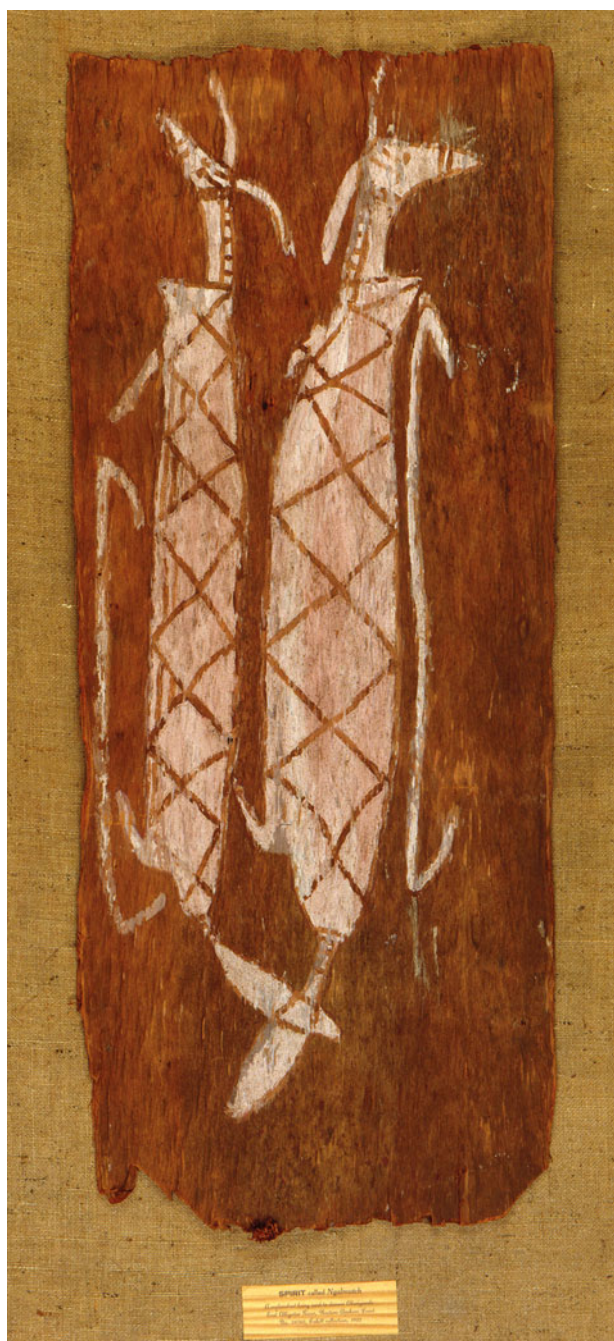
Figure 8. Paddy Cahill bark painting of back-to-back Rainbow Serpents, collected in 1922. (Courtesy Museums Victoria, museum number X28762).

an important local story that is also imprinted on the landscape for the early collectors Baldwin Spencer and Paddy Cahill.