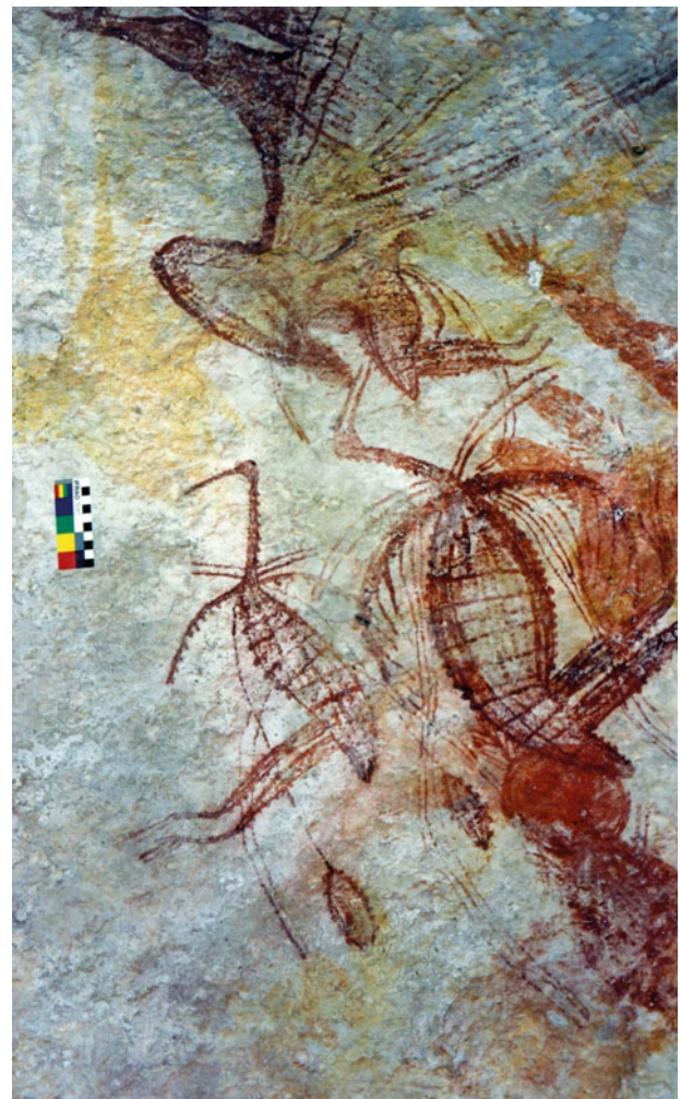
Figure 2. Yam Figure style back-to-back birds, Deaf Adder Gorge, Arnhem Land.

A single depiction of a two-headed thylacine-like creature can also be found in a rock-shelter in Kakadu National Park. It has a head at each end rather than a head and hindquarters (Fig. 4). At Djuwarr, in Kakadu National Park's Deaf Adder Gorge, there is a large, solid red painting of a Rainbow Serpent that has a snake body, human-like head, breasts, an arm and a leg. Two small back-to-back male human figures stand in the middle of her looped snake body (Fig. 5). The composition relates to a very important story about the Rainbow Serpent Ancestral Being swallowing two boys and