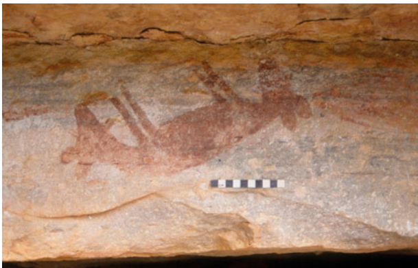
Figure 4. Double-headed 'thylacine' rock painting, Kakadu National Park.

(Chaloupka 1993, 188, fig. 209), a second composition by Nayombolmi of a 'split man' (Nakurrurndilhba) back-to-back figure about to have intercourse with a normal female figure, two back-to-back malevolent female spirits at Nanguluwurr, Kakadu (Hayward et al. 2021, 422, fig. 11) and back-to-back human female figures and birds at a number of Awunbarna (Mount Borradaile) sites. There are also large back-to-back macropods of unknown age at Djidbidjidbi (Mount Brockman, Kakadu), Djarrng (Taçon et al. 2021) and elsewhere, as well as two back-to-back macropods holding dilly bags and sticks about six kilometres north of Lightning Dreaming in the middle of Kakadu. Macropods holding these material culture items are associated with the mythological origin of the Wubarr ceremony (see e.g. Goldhahn et al. 2021). Maddock (1970) interpreted rock paintings of back-to-back male and female kangaroos at Gudabubi:m