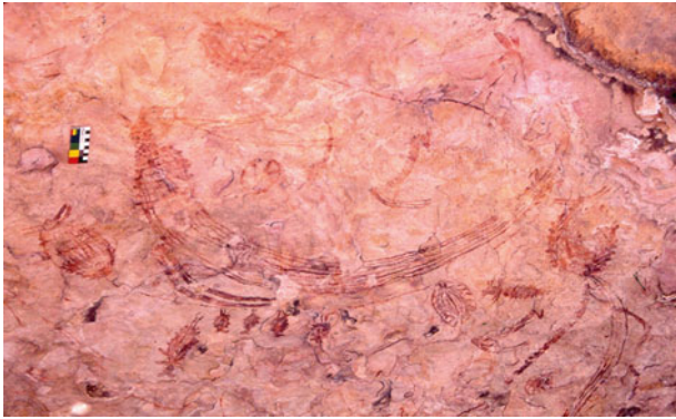
Figure 3. Yam Figure style back-to-back flying foxes hanging from a trailing line from the neck of a Rainbow Serpent along with other flying foxes, Deaf Adder Gorge, Arnhem Land.