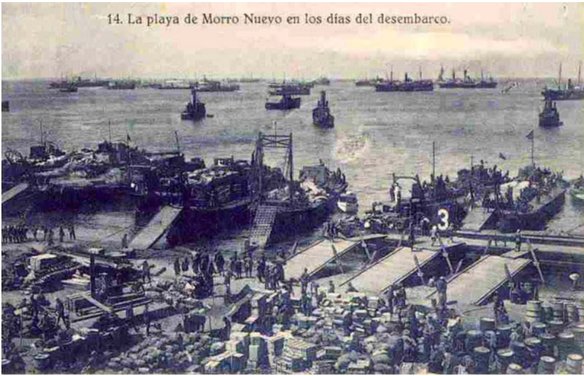
Figure 5. La playa de Morro Nuevo en los días del desembarco [Spanish troops landing at Al-Hoceima Bay on 8 September 1925].