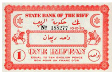
Figure 8. Bank note: State Bank of the Riff – Foreign Issues (1923).

personalities were serving foreign powers. Generally speaking, the joint military operation between France and Spain was the object of robust public diplomacy to avoid the emergence of international solidarity between Riffian nationalist forces and communist or anti-colonial movements.