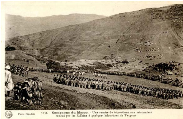
Figure 7. Campagne du Maroc. Une remise de décorations aux prisonniers rendus par les Rifains à quelques kilomètres de Targuist [Morocco campaign. A presentation of medals to prisoners returned by the Rifians a few kilometres from Targuist]. Postcard, Pascal Daudin's private collection.

which were collected by Spanish legionaries, paraded as war trophies and worn as necklaces or spiked on bayonets. Atrocities were perpetrated by both sides without much restraint.