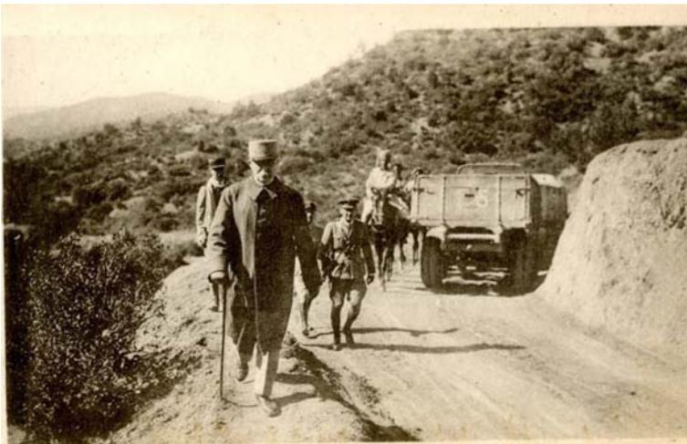
Figure 6. General Philippe Pétain inspecting the front.

After a year of intensive military action, the losses were huge, the tribes disbanded and Abd el-Krim had lost his last supporters, including those in his own tribe. In April 1926, Abd el-Krim's envoys met with French envoys in Oujda, telling them he could accept the offers of peace and autonomy made by the Sultan of Morocco, whose sovereignty he did not dispute. However, the talks