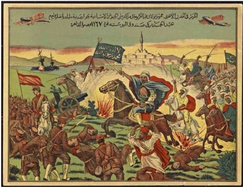
Figure 1. Abdelkrim rejetant les Espagnols, en 1921, bataille d'Anoual, lors de la guerre du Rif, Archives nationales d'Outre-Mer [Abd el-Krim rejecting the Spanish, in 1921, Battle of Annual, during the Rif War, National Overseas Archives].