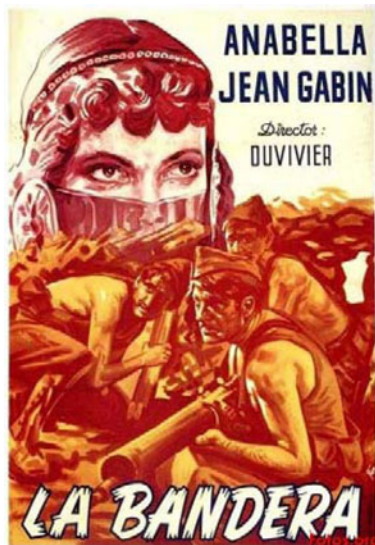
Figure 2. Film poster.