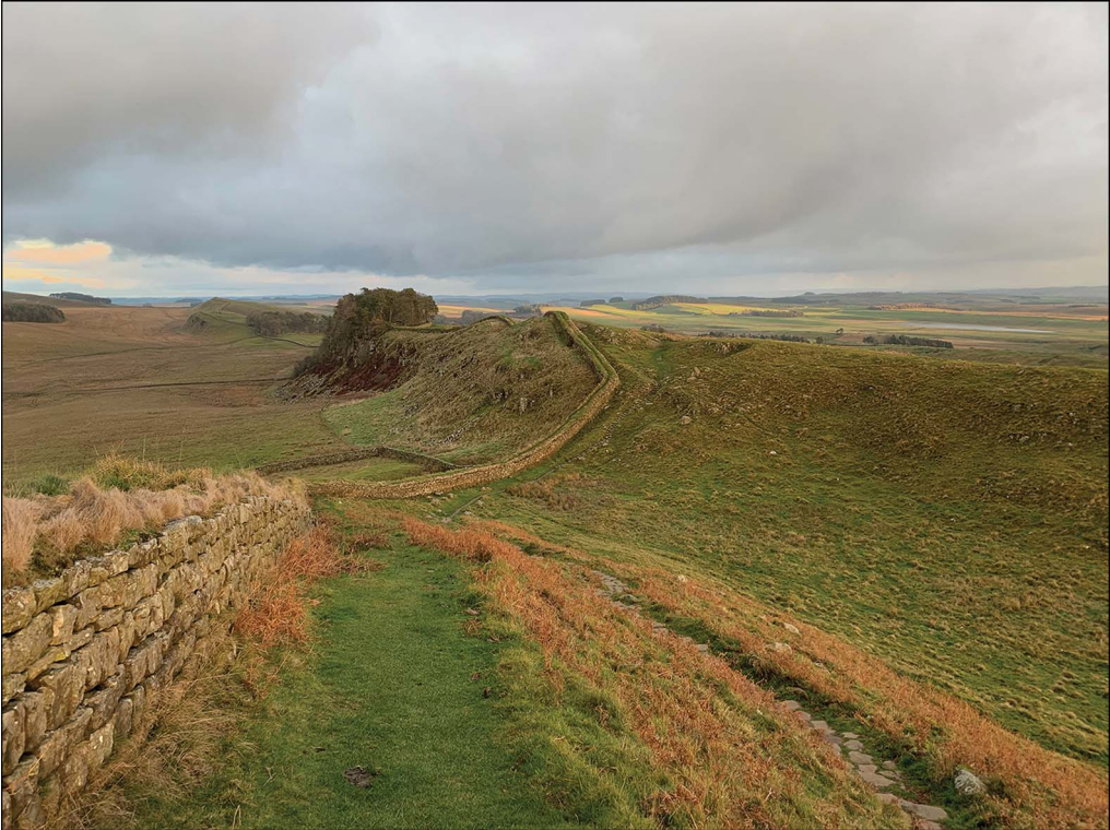
Figure 1. Photograph of part of Hadrian's Wall, near Housesteads, Northumberland.

the UK and the USA. Commentators from across the political spectrum, for example, sought to compare former President Trump's efforts to build a wall along the US/Mexico border with Hadrian's Wall (Flynn 2019; Jenkins 2019). Writing for the New Yorker on the eve of Trump's inauguration, de Monchaux (2016) remarked that: