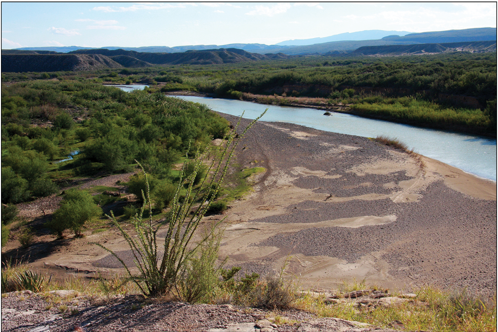
Figure 5. The US/Mexico border on the Rio Grande.

Archaeologists studying the landscape of the US/Mexico border have consistently recognised the potential humanitarian impact of their research. McGuire (2013: 467–68)