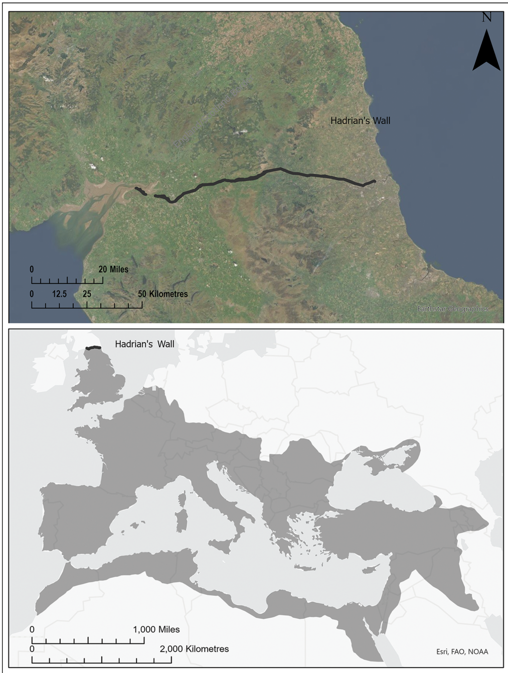
Figure 2. Maps of Hadrian's Wall and the Roman Empire (figure by B. Buchanan).

note that “the broader task of public archaeologies of frontiers and borderlands is an as-yet largely unexplored field”, and one that must be developed. This is particularly pressing in the context of the development and reliance on hard boundaries—often demarcated by