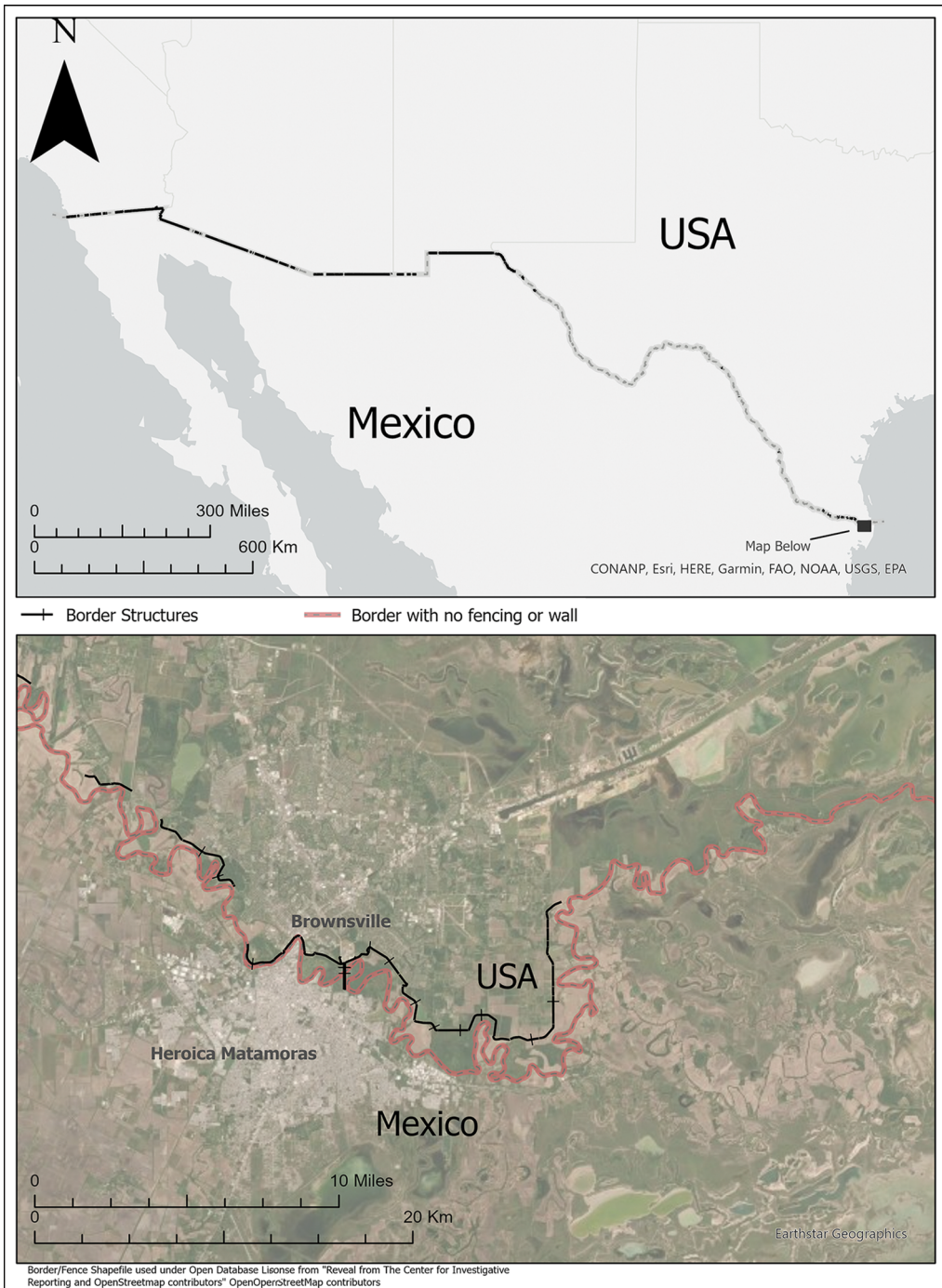
Figure 3. Maps of the US/Mexico border (figure by B. Buchanan).