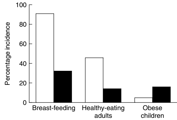
Fig. 3. Summary of the potential influence of social class on the incidence of breast-feeding, adult healthy eating (defined as the daily consumption of five or more portions of fruit and vegetables) and childhood obesity. Percentages of the population are given in relation to the best five (□) and worst five (■) performing areas of the UK (53) .

The epigenome is most susceptible to dysregulation during those periods of life associated with the greatest changes in organ development and growth, i.e. embryogenesis, fetal and neonatal development, puberty and final old age (56) . For example, in the more-extreme challenge of uterine artery ligation in the late-gestation rat, which reduces uterine artery blood flow by approximately 50% (57) , substantial intrauterine growth retardation occurs (58) . When these offspring are cross-fostered onto control dams they show rapid catch-up growth, an adaptation that is likely to be as important in determining the subsequent adverse outcomes as the preceding growth restriction in utero (59) . As adults these growth-manipulated offspring exhibit type 2 diabetes that is associated with progressive epigenetic silencing of the homeobox 1 transcription factor Pdx1 (60) , which is critical for pancreatic \beta -cell function and development (60) . Nevertheless, during the neonatal period the reduction in Pdx1 expression could be reversed in vitro by inhibition of histone deacetylase action. Potential epigenetic effects may well be extended to a number of other tissues and cells and could include the regulation of the intracellular energy locus, as recently shown in vitro (using