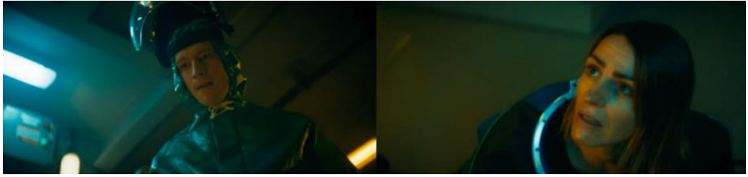
Figure 3. The spy is unmasked.

responsible stewards of international security, while other states are cast as fundamentally irresponsible and denied the same autonomy. 60 Decisions made by the United States and its allies are assumed rational by default, while decisions made by non-Western states are continuously labelled as ideological rather than strategic – delegitimised through reference to religion or culture. 61 Nuclear weapons possess the material capabilities no matter their state ownership, yet time and time again nuclear discourse constructs Western weapons as rational, modern, and safe while non-Western weapons are constructed as impulsive, backwards, and dangerous. Nuclear weapons can be understood as safe and secure in ‘our’ hands, while being dangerous threats in the hands of another. Continuing this narrative into spaces of the everyday, in the BBC’s Vigil , whether nuclear weapons are presented as agents of peace or destruction is conditional to their ownership – to whether they are controlled by ‘us’ or ‘Other’.