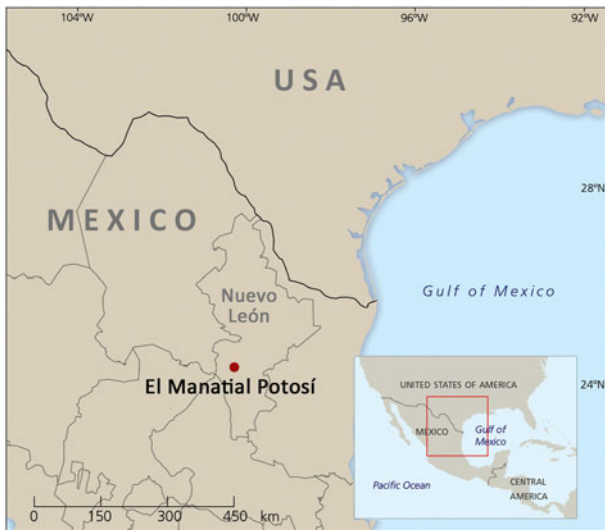
FIG. 1 Location of El Potosí spring in Nuevo León, Mexico, which is the only known habitat of the Catarina pupfish Megupsilon aporus .

pondweed Potamogeton sp., duckweed Lemna sp., green algae, and grasses restricted to shallow areas (Miller & Walters, 1972; Guzmán-Cedillo, 1981).