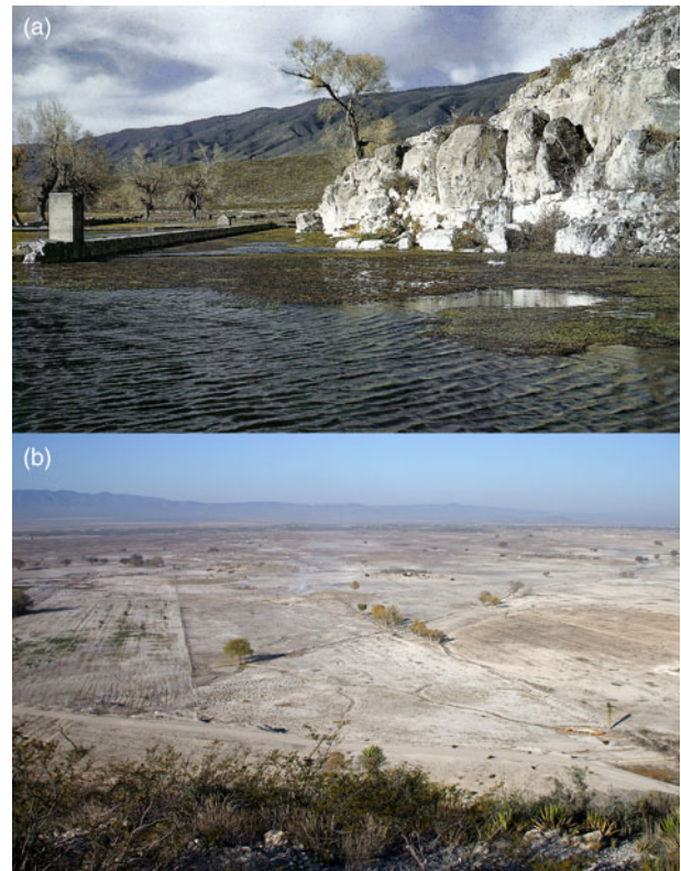
PLATE 2 Habitat degradation and desiccation of the El Potosí spring in Nuevo León, Mexico (Fig. 1). (a) The spring in 1961, and (b) in 2009.

The Catarina pupfish was oviparous, with no breeding territoriality. The species presented two characteristic behaviours: opercular rotation and jaw-nudging during courtship (Liu & Echelle, 2013). Courtship and mating took a unique form, with no aggressive behaviour; instead attractive movements were performed to bring about successful spawning. Mating was usually carried out at dawn or dusk