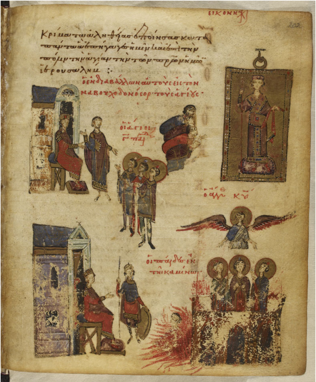
Fig. 2 The Three Jews Cast into the Fiery Furnace, Theodore Psalter , Constantinople, 1066 (photo: ©British Library Board, Add Ms 19352, fol. 202r).

Gaza tells us, they were depicted in bright and precious colours and sometimes showed the use of gold leaf. 4 They were exhibited as representations of empire – legitimizing objects struck by the imperial workshops, like coins and weights – and were the focus