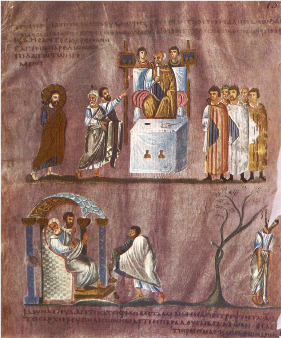
Fig. 5 Pilate's court, Codex Purpureus Rossanensis , 6 th century (Rossano Calabro, Museo Diocesano, Codex Purpureus Rossanensis , fol. 8 r ).

practice of kissing the imperial seal which bore the emperor's bust. 77 In the Acts of Nicaea II the imperial purple robe and seal were to be honoured as if they were the emperor himself. 78 A fourth-century passage attributed to Ambrose expresses the same concept in