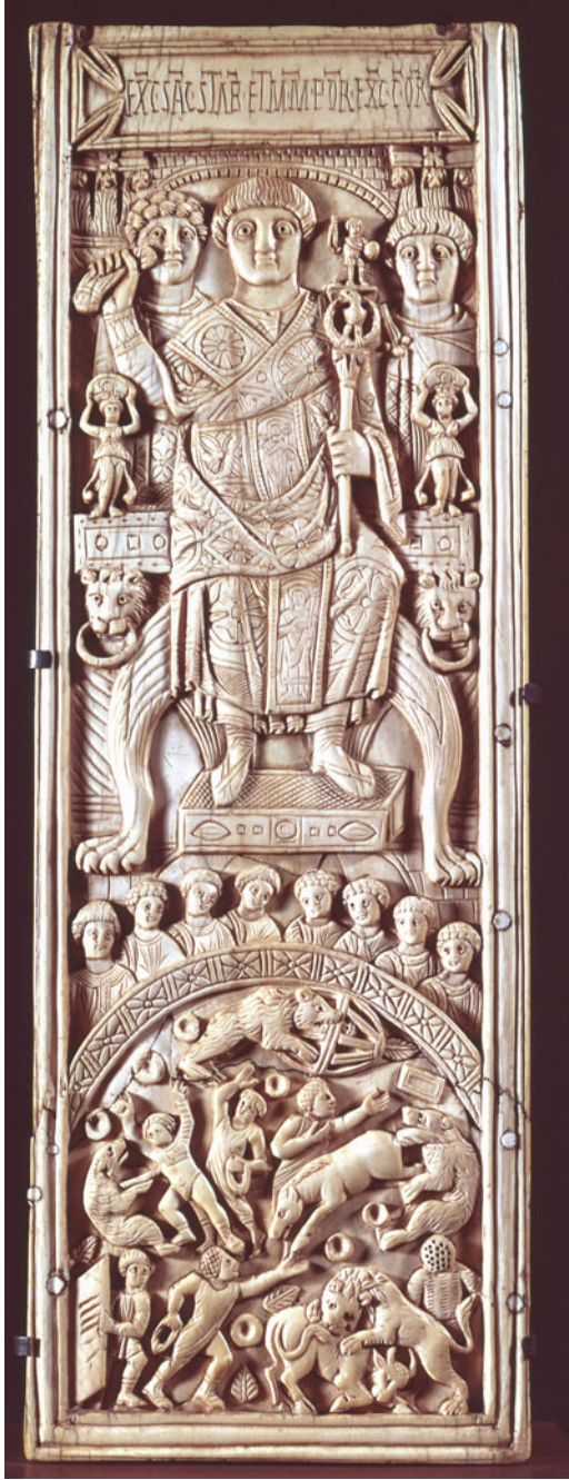
Fig. 4 Diptych of Areobindus, Constantinople, 506 (Paris, Musée de Cluny, inv. no. CL13135).