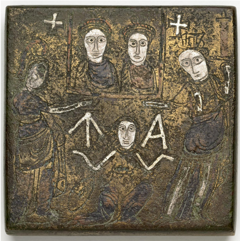
Fig. 1 Copper alloy weight, 4 th -5 th century (London, The British Museum, inv. no. 1980, 0601.3; photo: © The Trustees of the British Museum. Shared under a Creative Commons Attribution-NonCommercial-ShareAlike 4.0 International (CC BY-NC-SA 4.0) licence).

crowned, wearing a purple chlamys and a gem-studded loros , on a suppedaneum of the same material as his robes. Here, the Biblical, gilded image of Nebuchadnezzar is replaced by an imperial painting. 3 In Late Antiquity as in the eleventh century, painted panels of emperors – icons, as they are repeatedly called in primary sources – were understood as objects of veneration. As the mid-sixth century monk Dorotheus of