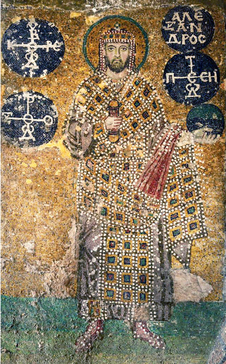
Fig. 6 Mosaic of Emperor Alexander (r. 912–913), Hagia Sophia, Constantinople.

with the akakia , a silk cylinder filled with earth, as represented among the insignia of Alexander (r. 912–913) in his mosaic at Hagia Sophia. (Fig. 6) But the akakia is already mentioned in the ninth century, when Philotheus interprets it as a sign of