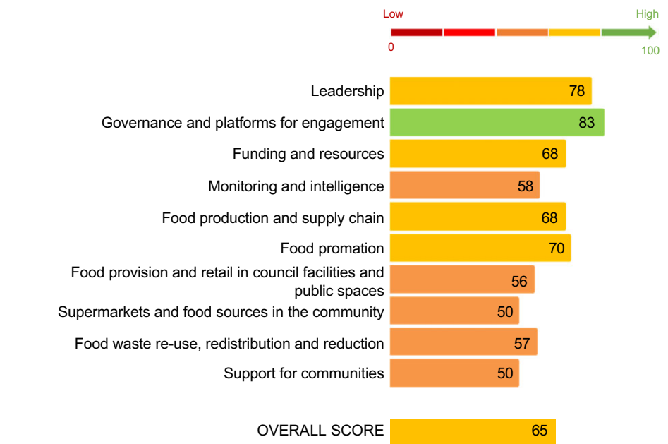
Fig. 2 Results from the pilot assessment (score out 100) of the implementation of policies for creating healthier, equitable an environmentally sustainable food systems in the City of Greater Bendigo using the Local Food Systems Policy Index (Local Food-EPI+) tool in 2022. 'High' (81–100 %); 'very good' (61–80 %); 'good' (41–60 %); 'fair' (21–40 %); and 'very low, if any' (0–20 %) implementation