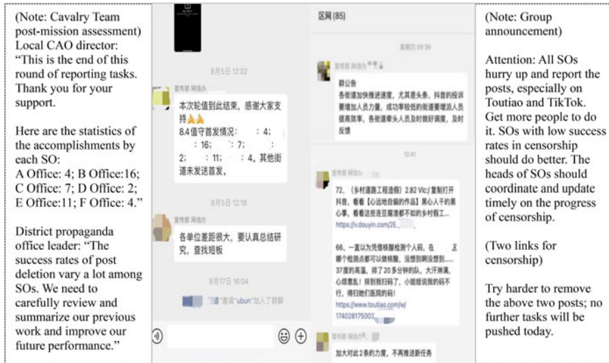
Figure 5. Screenshots of a Typical Conversation in the Cavalry Team WeChat Group

negative voices through WeChat group conversations. Figure 5 shows a screenshot of a typical conversation in the Cavalry Team WeChat group. Members used the chat to coordinate mass reporting, evaluate the performance of each member, debrief leaders on outcomes and provide a daily summary.