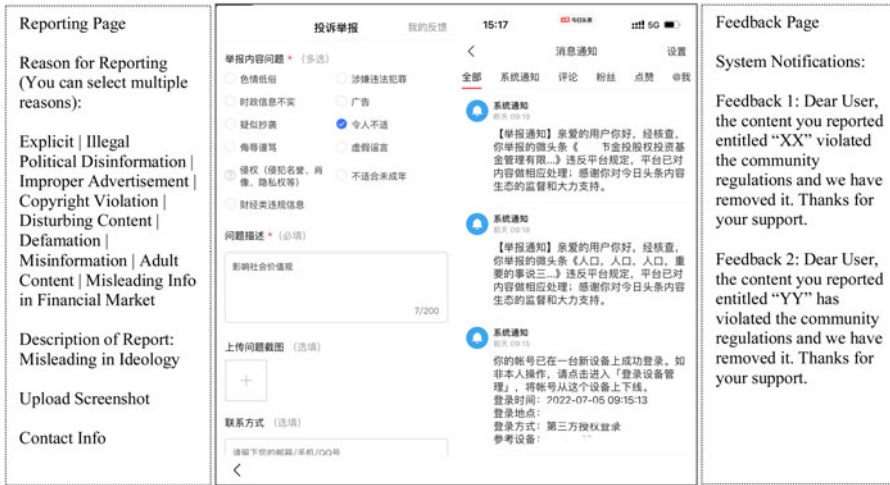
Figure 4. Screenshots of the User-reporting Interface and Feedback Page on TouTiao.com ( Jinri toutiao 今日头条)

years of censorship and propaganda, there are few dissenting voices remaining on social media in China. As a result, local CAOs mainly target complaints about local issues, which are numerous but less conspicuous and harder to capture. It is also harder to justify their removal, as they are often trivial and apolitical. Furthermore, accounts that frequently report others without valid reasons lose their credibility and are downweighed by social media platforms in future reporting.