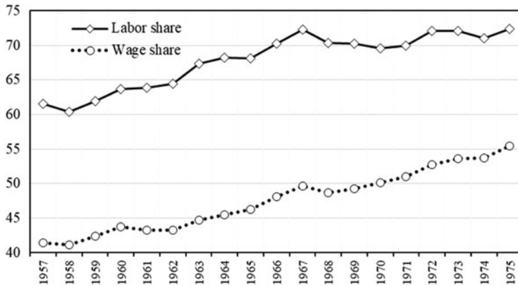
Figure 1. Evolution of the labor share and the wage share (1957–1975)

Notes: The wage share is the compensation of employees as a percentage of GDP at the cost factor. It includes wage payments for self-employed workers.