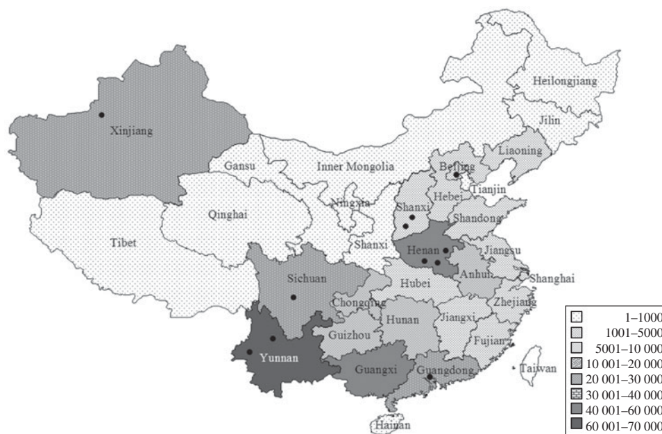
Fig. 1. Map of cumulative cases of HIV infection in China according to province by the end of 2008. Sample sites are indicated by black dots (data from Chinese CDC).

general population [3]. In 2002, China integrated hepatitis B vaccine into the National Expanded Programme on Immunization (EPI), with emphasis on providing a timely birth dose (within 24 h of birth). A recent epidemiological serosurvey of hepatitis B in China found that the weighted prevalence of HBsAg for the Chinese population aged 1–59 years was 7.2%, and in children aged <5 years it was only 1.0% [4]. Although prevalence of HBsAg has declined as a result of the effectiveness of the vaccination programme, HBV infection is still endemic in China. According to a multicentre epidemiological study in China between 1991 and 1995 (about 90 000 persons investigated), HCV prevalence averaged 2.2% in the general population (range 0.52–3.15% between participating centres), amounting to about 26.4 million infected individuals [5]. Recent social and economic changes greatly increase the potential for a substantial Chinese HIV epidemic. By 2007, the number of people living with HIV is estimated to be 700 000, including 85 000 AIDS patients [6]. Limited data have shown that HCV and HBV infection in HIV-positive patients was more prevalent than in the general population.