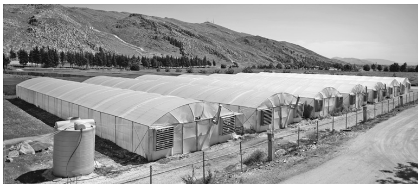
Figure 1.3 A row of greenhouses at ICARDA's research station and "temporary headquarters" (since 2012) in Terbol, Lebanon, 2018.

projects to make agrarian networks in the Eastern Mediterranean amenable to extraction. As the competition of Ottoman and French visions for agricultural productivity was made inert by the post–World War I fracture of the land into French and British mandate regions, the succeeding order facilitated intensified extraction according to technocratic and capitalistic forms of land and resource management. 58 The cumulative destabilization of land tenure systems, fragmentation of trade networks, and reintegration of territory into a nation-state divided between Mediterranean coastal plain and Syrian desert had created the preconditions for political, economic, and sectarian crisis. These same conditions provided the justification for renewed attention to agricultural development projects, framing the problem as one of low productivity with climatic and cultural causes.